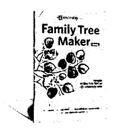
Figure 2.2: Family Tree Maker Pack

Actually the Family Tree Maker 2009 is family tree creator. it help us to create family tree and the end of the result is a family history that yu and your family will treasure for years to come. The ability to add photos and audio and video files to your tree[4]. It not really focus on save data of the family members. The application must buy before used.