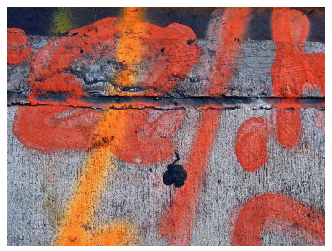
Street Seen - Con Ed Markings