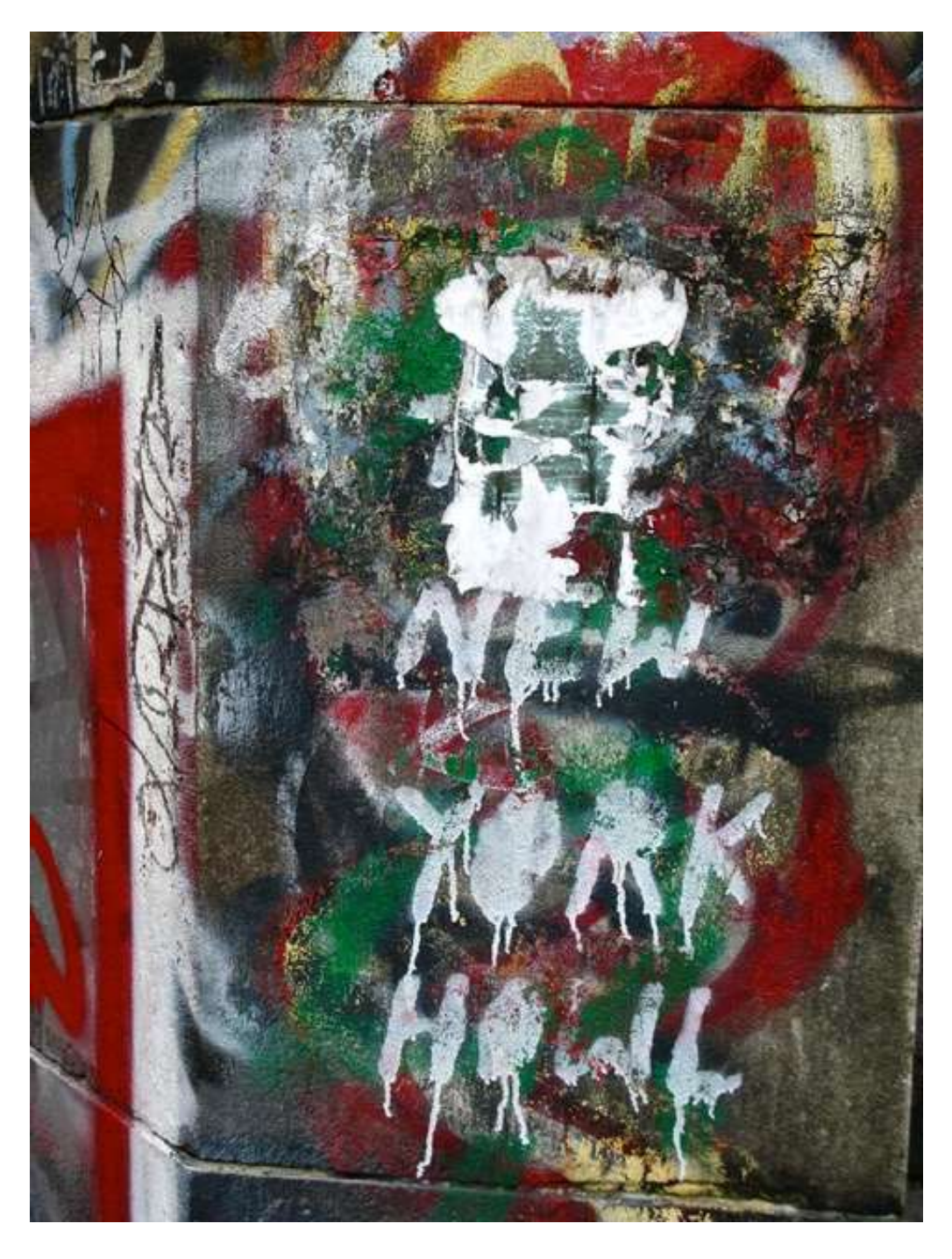
Graffiti - New York Howl