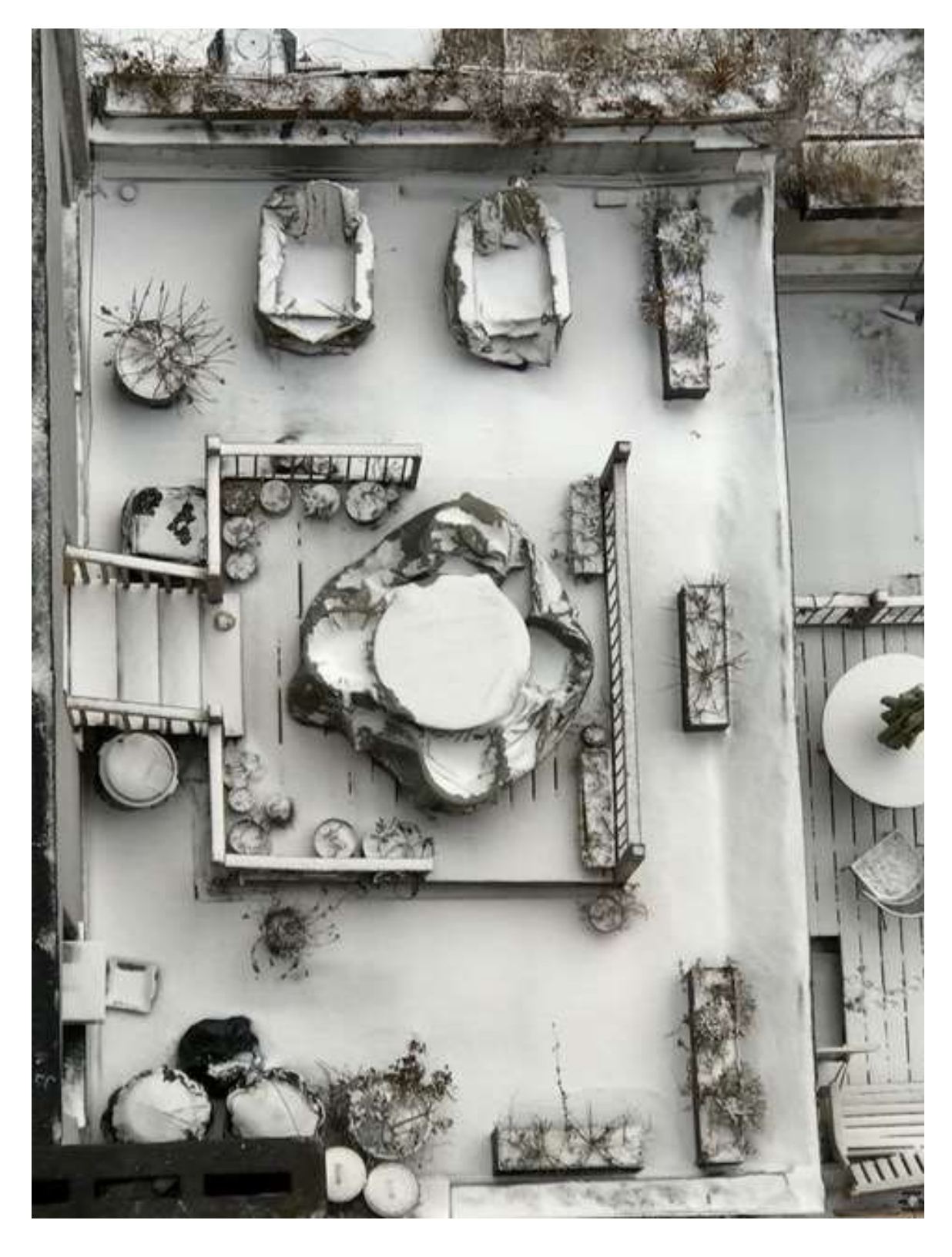
Winter Roof Top