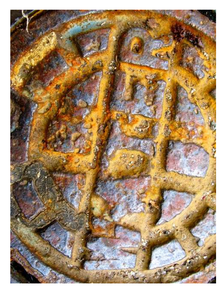
Eroded Water Cap