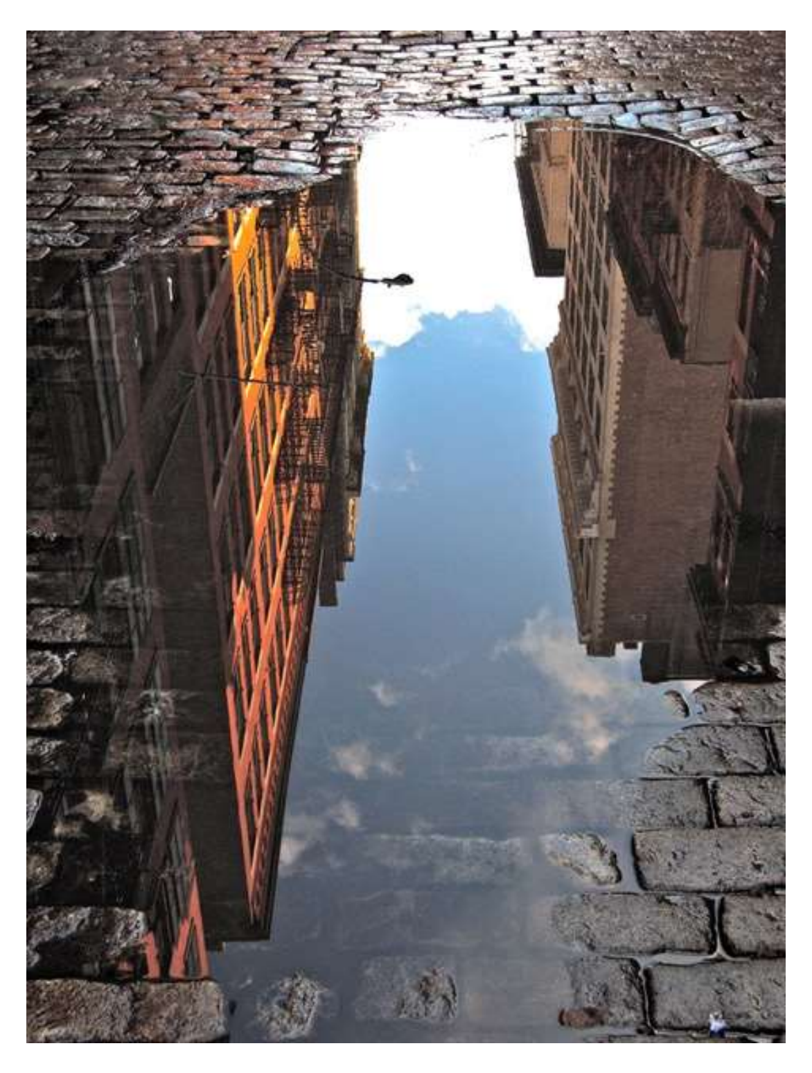
Puddle Reflections- Crosby Street