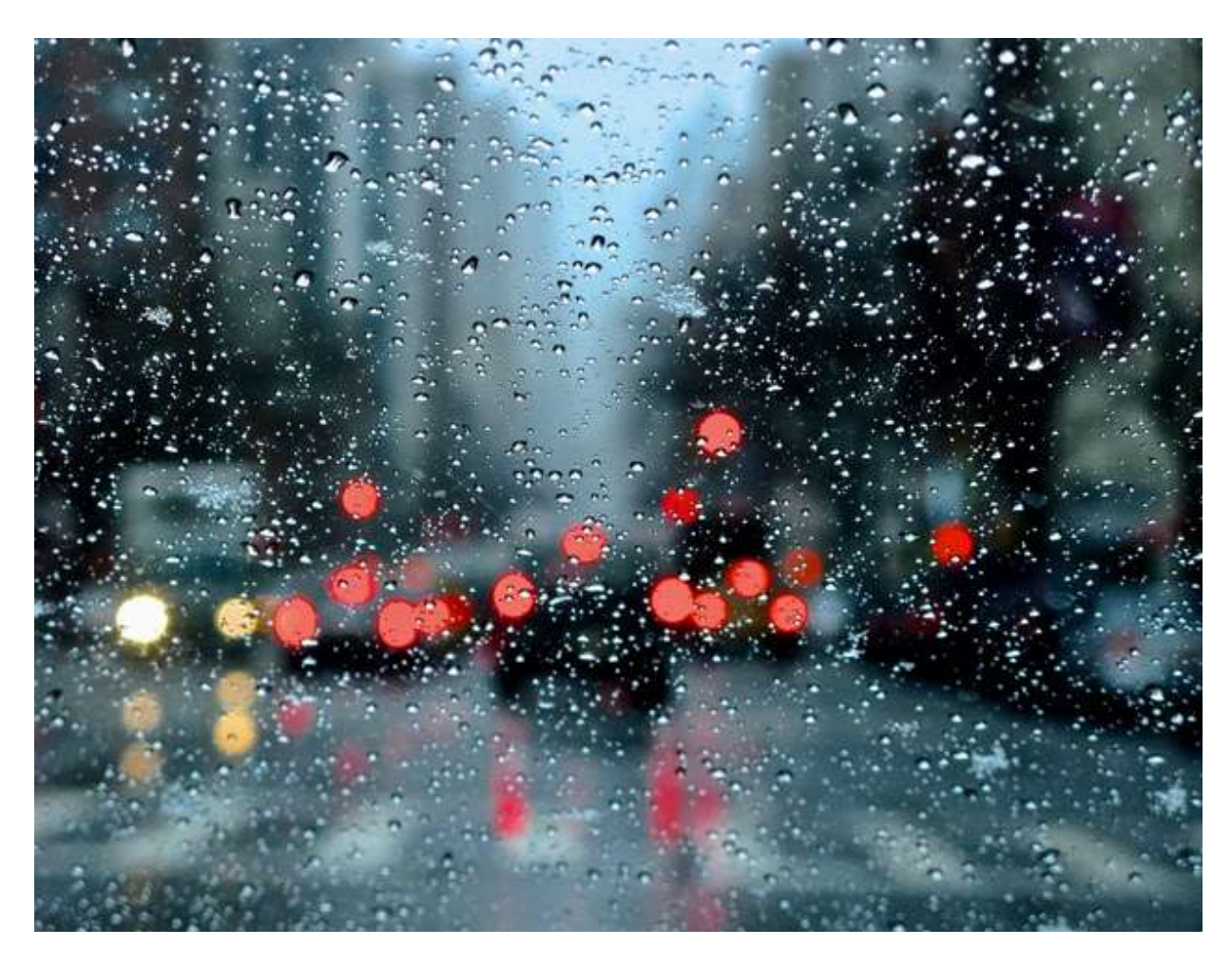
Rain - Fifth Avenue