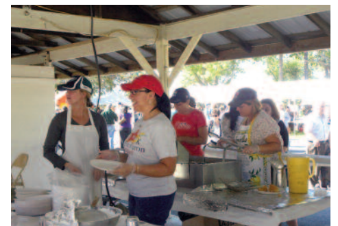
Crowd at the St. Padre Pio Festival and festival workers,

each Sunday, but it is the people that make the Church. From his very first days as pastor, he set his sights on bringing the people in and having them take ownership. He can often be heard saying, this is "your" parish and "your" family.