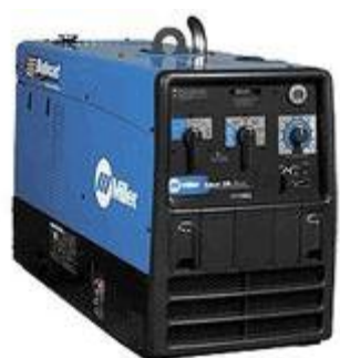
BOBCAT 250 DIESEL 11,000 WATTS PEAK POWER KUBOTA D722 DIESEL ENGINE EPA TIER 4 COMPLIANT 250 AMP AC/275 DC WELDS TRI-COR TECHNOLOGY