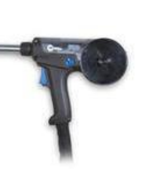
SPOOLMATE 200 EASILY CONNECTS TO MILLERMATIC 211, 212, 252 FOR ALUMINUM WELDING