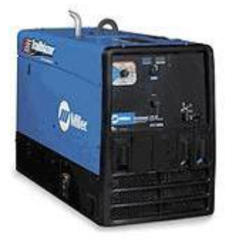
TRAILBLAZER 275 DC 11,000 WATTS PEAK POWER KOHLER CH23 GAS ENGINE 275 AMP DC ONLY WELDER