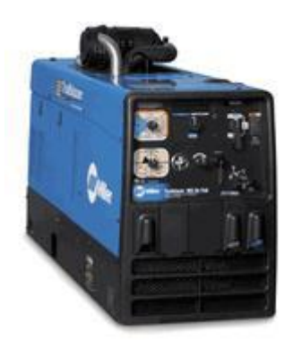
TRAILBLAZER 302 AIRPAK 13,000 WATTS PEAK POWER KOHLER CH750 GAS ENGINE BUILT-IN 26 CFM COMPRESSOR BUILT-IN BATTERY CHARGING