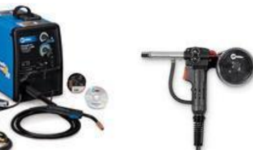
SPOOLMATE 100 EASILY CONNECTS TO MILLERMATIC 140, 180, 211, AND PASSPORT PLUS FOR ALUMINUM WELDING