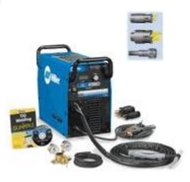
DIVERSION 180 TIG TIG UP TO 3/16" ALUMINUM 180AMP AC/DC TIG HF START 115V/230V DUAL VOLTAGE BUILT-IN FINGERTIP CONTROL