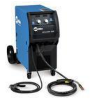
MILLERMATIC 350/350P WELDS UP TO 1/2" STEEL, 1/2" ALUMINUM WITH OPTIONAL SPOOLMATIC 30A OR ALUMA-PRO SYSTEM