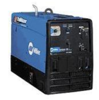
TRAILBLAZER 302 11,000 WATTS PEAK POWER KOHLER CH23 GAS ENGINE 225 AMP AC/300 AMP DC WELDS EXCELLENT MIG/FCAW PERFORMANCE, LIFT ARC TIG