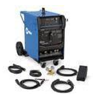
SYNROWAVE 200 RUNNER TIG UP TO 1/4" ALUMINUM AC BALANCE CONTROL WITH SYNCRO START TECHNOLOGY 120V AUXILIARY POWER