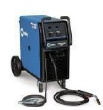
MILLERMATIC 252 WELDS UP TO 1/2" STEEL, 1/2" ALUMINUM WITH OPTIONAL SPOOLMATIC 30A