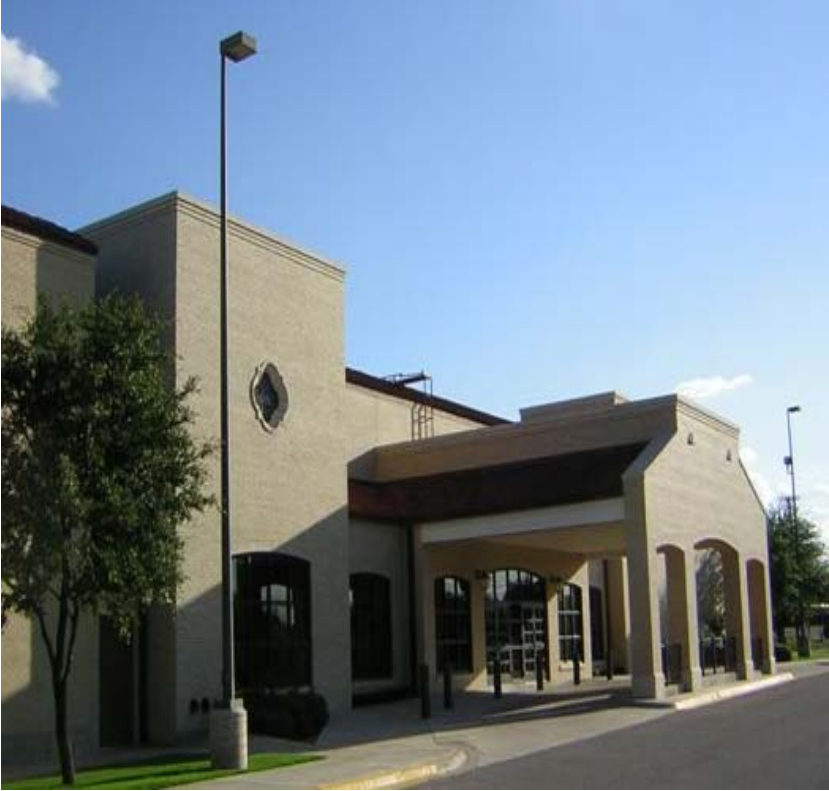
First Baptist Church - Midland 2104 W. Louisiana, Ave. 1996 Midland, Texas 79701

Project Scope: New Fellowship Hall & Education Space