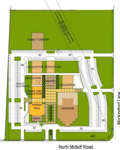
Master Site Plan Christ Church Midland

This document is prepared for specific review only. It is confidential and may not be used for regulatory approval, permit, or construction without written consent of JSA Architects.