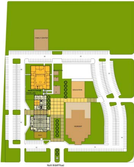
Master Site Plan - Option A Christ Church Midland