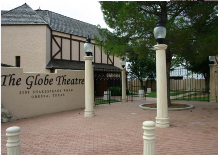
Globe of the Great Southwest 2002-2008 2308 Shakespeare. Odessa, Texas