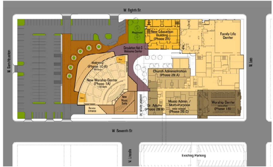
Master Plan - Ground Floor First Baptist Church - Odessa