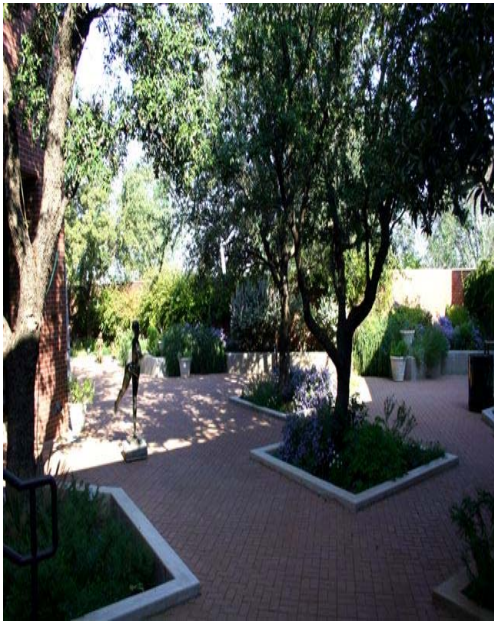
Ellen Noel Art Museum 1996 - 1998 4909 E. University Odessa, Texas