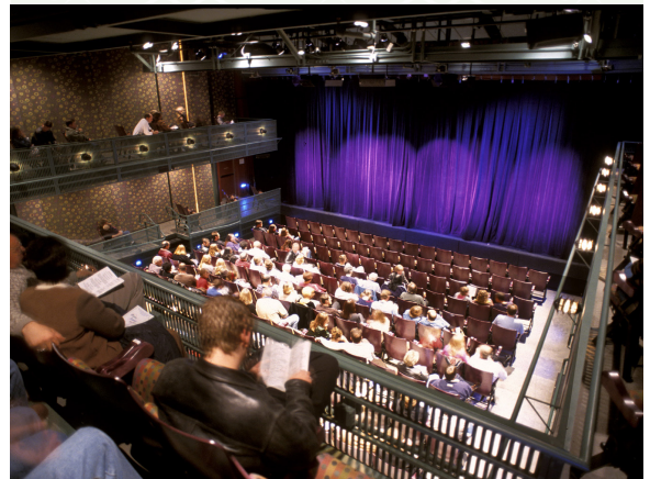
Plano Courtyard Theater Plano, Texas