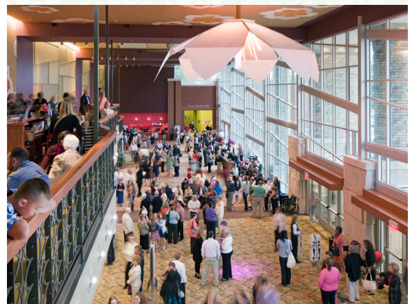
Southern Kentucky Performing Arts Center Bowling Green, Kentucky