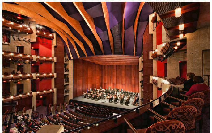
Hylton Performing Arts Center at George Mason University, Manassas, Virginia