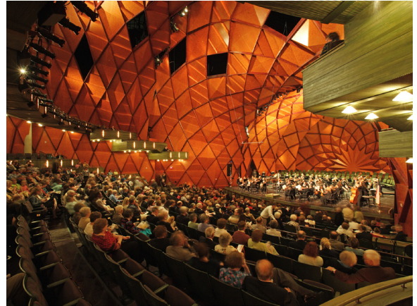
The Globe News Center for the Performing Art Amarillo, Texas