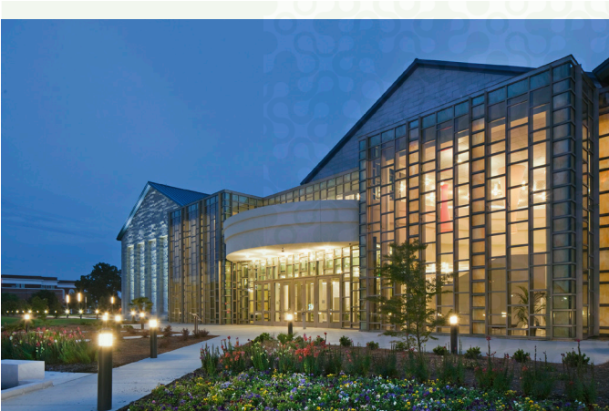
Francis Marion University, Performing Arts Center Florence, South Carolina

Meeting Two: Delivery of Executive Summary and Final Report ..... Day 61 ..... Nov. 4