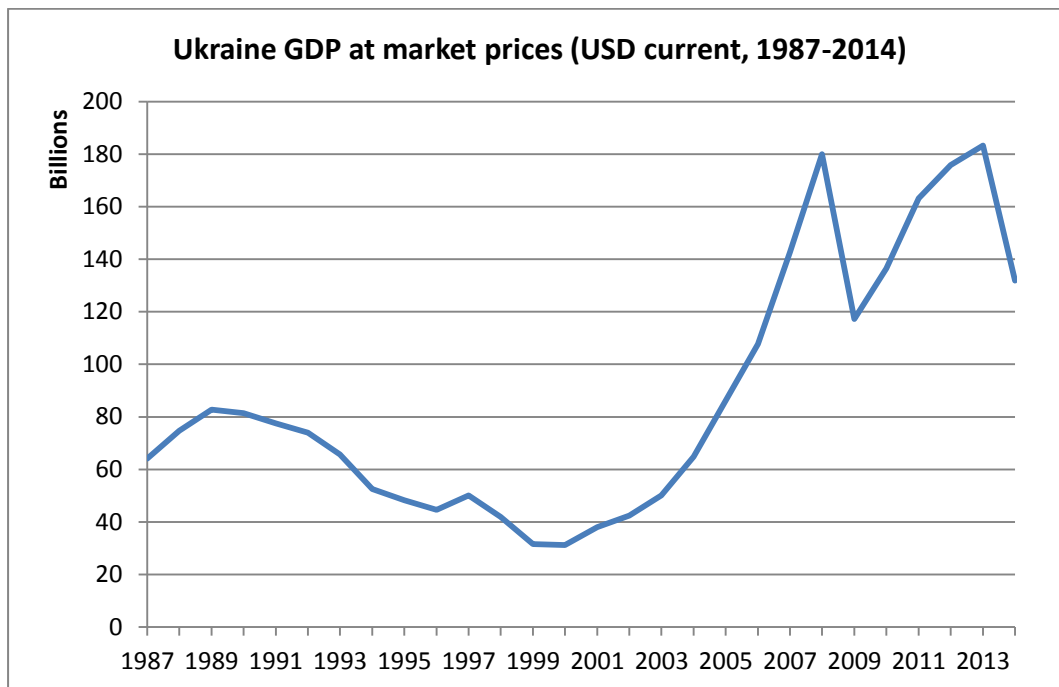
Figure 1. Frequency of shocks in Ukraine (1987-2014)

economy, larger social transfers, and a lower price for imported natural gas. The crisis that began in 2014, however, is ongoing.