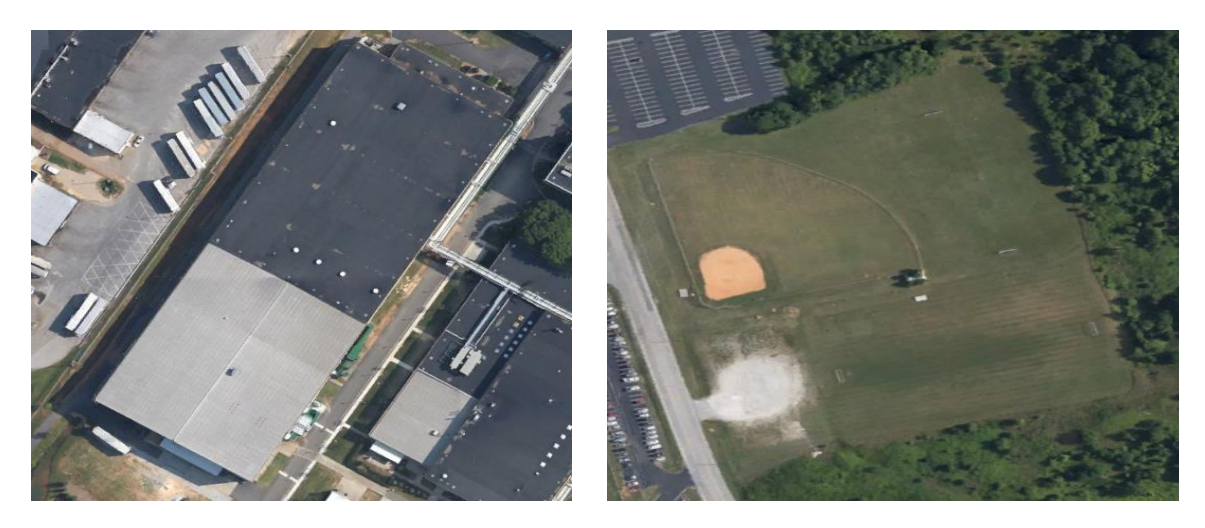
Figure 1: The roof of the building and the adjacent area.

sized to use an entire available site area. Two sites are considered: part of the building roof and the adjacent area, represented in the Figure 1.