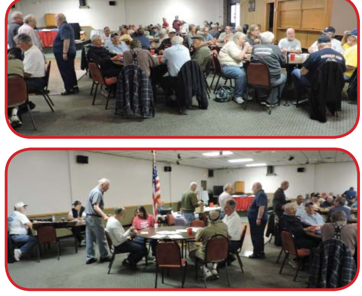
JUNE FMRCOA MEETING