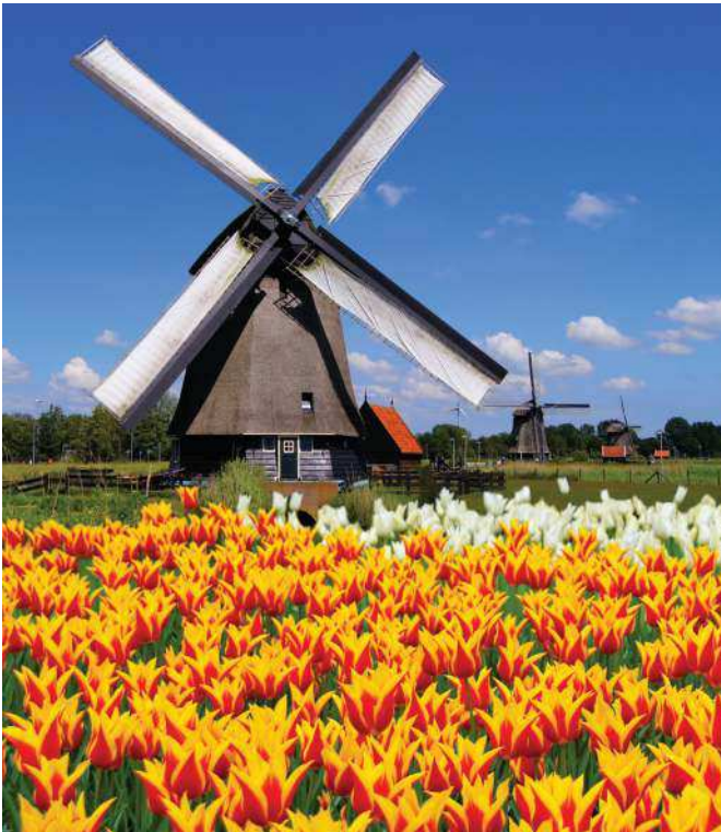
Figure 1.8 Traditional Dutch windmills with vibrant tulips