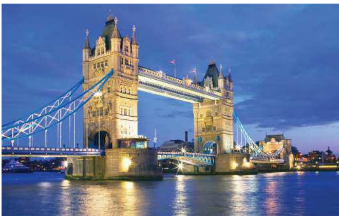
Figure 1.9 London Bridge at night