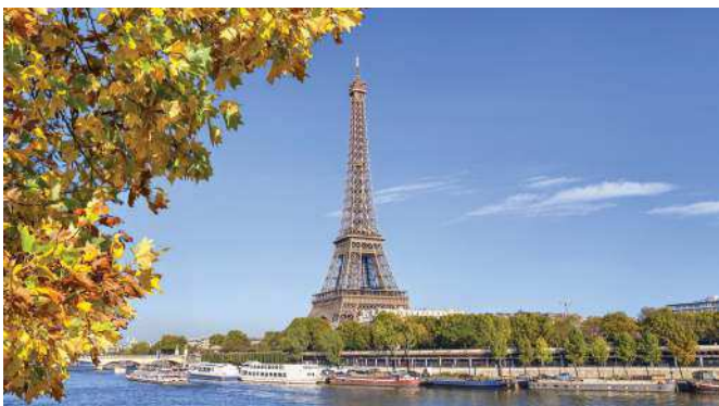
Figure 1.6 Eiffel Tower, Paris in autumn

Depending on where you are in the world, the demand for various tourism products and services will vary throughout the year, often reflecting the local seasonal climatic conditions. Figure 1.6 shows an important French attraction.