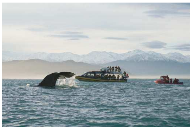
Figure 1.1 Whale watching in New Zealand