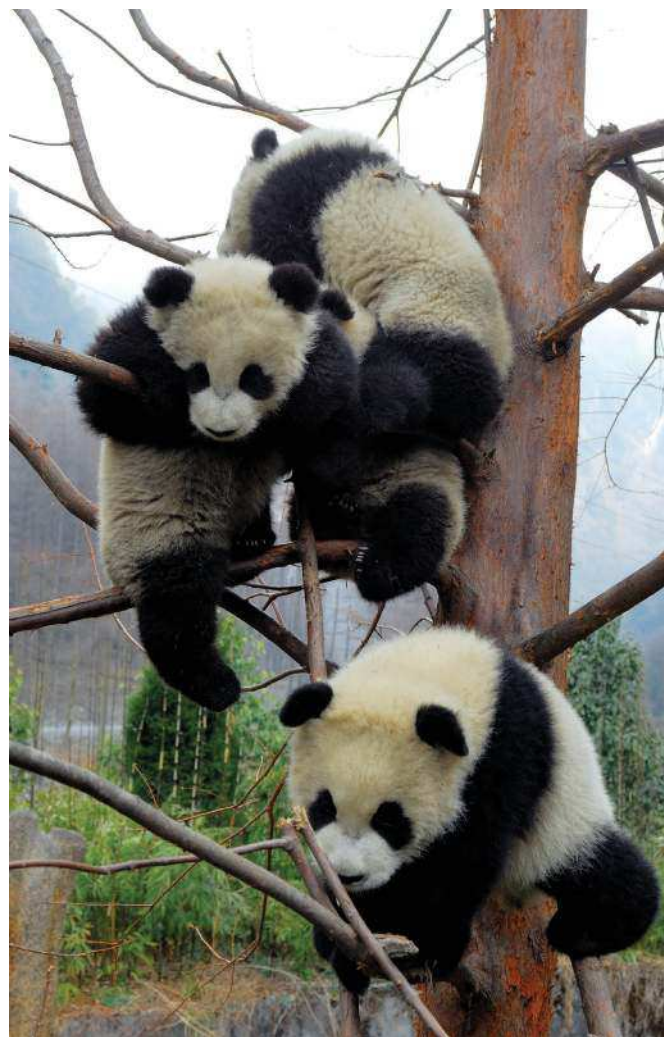
Figure 1.5 Pandas playing at the Bifengxia Panda Reserve in Ya'an, in the Sichuan Province of China

For many tourists, it is the range of leisure activities available within a destination that influence the decision to visit. For example, the 'Discover the best of Mauritius' website lists kite surfing, swimming with dolphins, canyoning, underwater walking, mountain biking and golf as just some of the leisure pursuits that the island offers to its visitors. Or for some, the travel motivation is the availability of one particular leisure activity within a destination, for example, visiting the Bifengxia Panda Reserve in Ya'an, in the Sichuan Province of China (Figure 1.5).