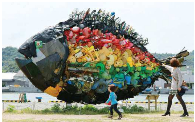
Figure 1.3 An exhibit at The Setouchi Art Festival in Japan

Crafts reflect the artistic sense, feelings and cultural characteristics of a destination. People often choose destinations which offer traditional handicrafts, although this is unlikely to be a main travel motivation; combined with other cultural 'pulls' it might be one of a number of reasons why tourists visit a particular destination. In Turkey, for example, weaving materials from wool, mohair, cotton and silk are popular forms of handicrafts, which tourists often observe during their visit and purchase as souvenirs.