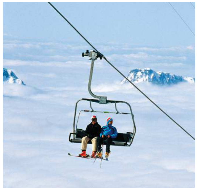
Figure 1.11 Skiers in mountains on a ski lift, Switzerland