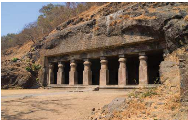
Figure 1.4 The Elephanta Caves in western India

Historical attractions play an important part in tourists' decisions to visit a destination. Cities often offer a choice of many different historical attractions, for example in Rome visitors can visit the Colosseum, the Roman Forum and the Pantheon. Or there are the Elephanta Caves located in western India, which is a UNESCO World Heritage site (see Figure 1.4).