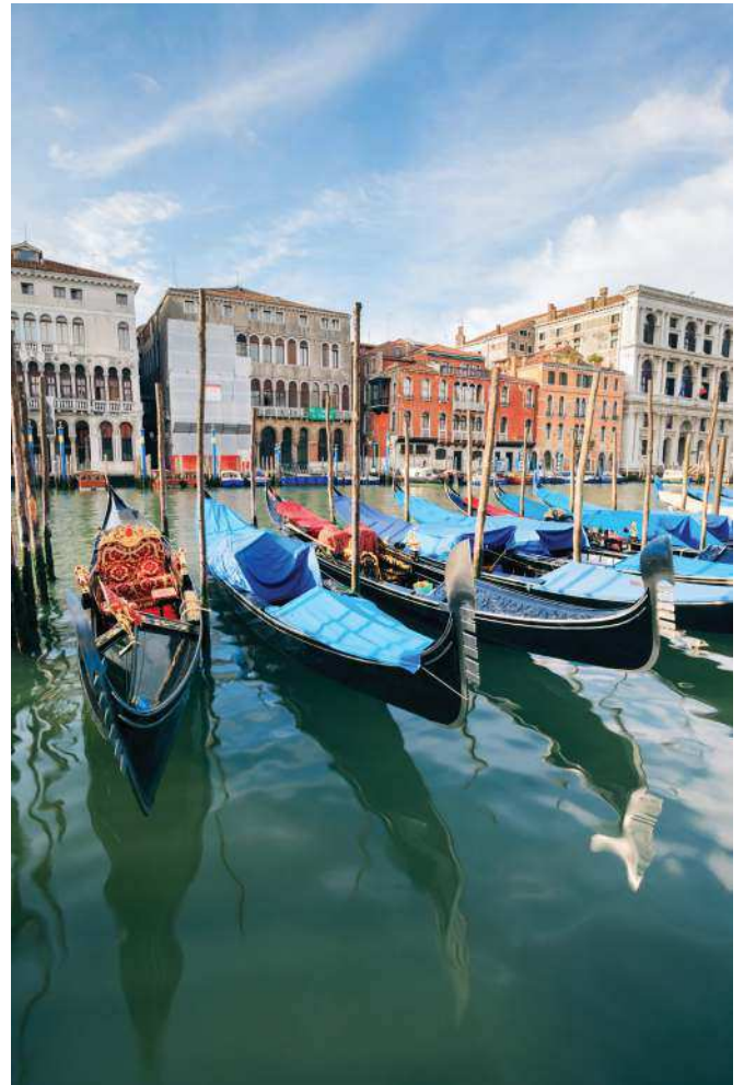
Figure 1.10 Beautiful Venetian scenery