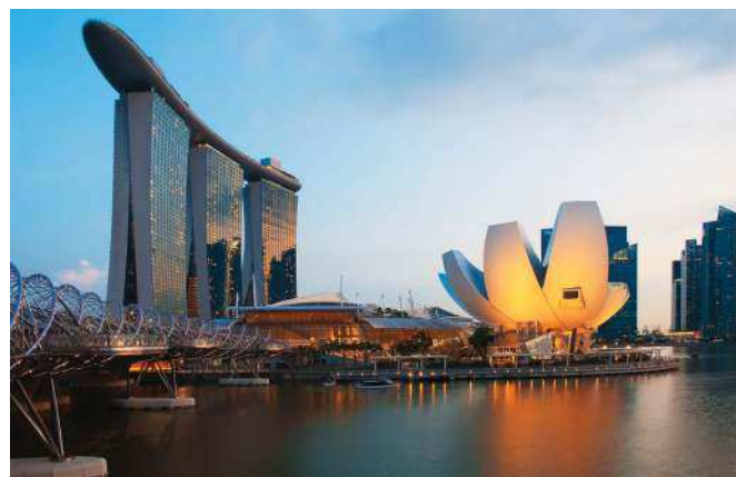
Figure 1.2 The Marina Bay Sands Integrated Resort, in Singapore