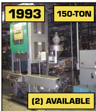
1993 Newbury V9-150ARS

(6) 30-Ton Autoejector MDL. HT30-S , with vertical 6-station indexing table, 3 oz. Shot, 7.5 HP Motor, S/N H3T3P-97-1088 (1988), H3T3D-22-0189 (1989), H3T3D-0812-1288 (1988), 44404E11 (1983), 444062390285 (1985), N/A