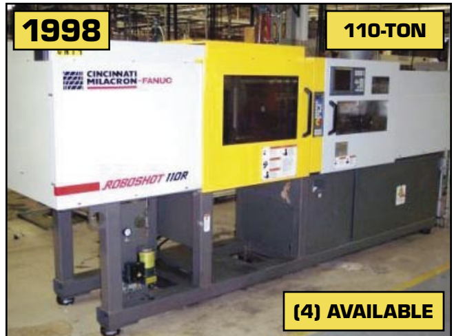
1998 Cincinnati Roboshot 110R