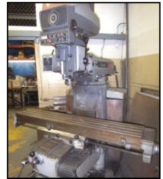
Bridgeport Series II