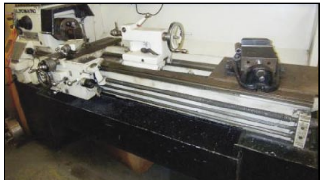
LeBlond "Regal Servo" Engine Lathe