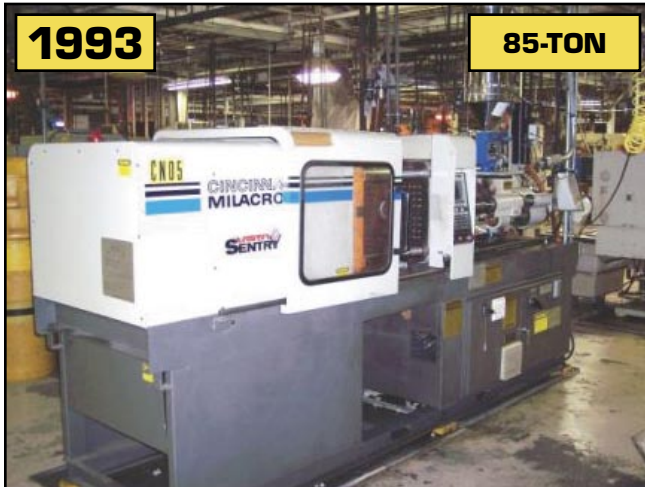
1993 Cincinnati VSX-85-4.44