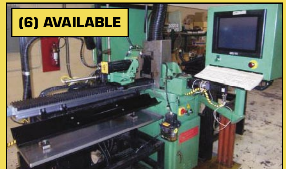
Royal Master T6-12 GEN X-A Centerless Grinder