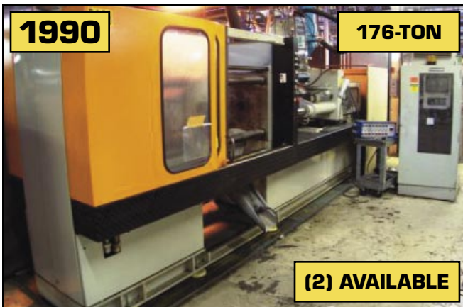
Cincinnati Vista VSH-50-9