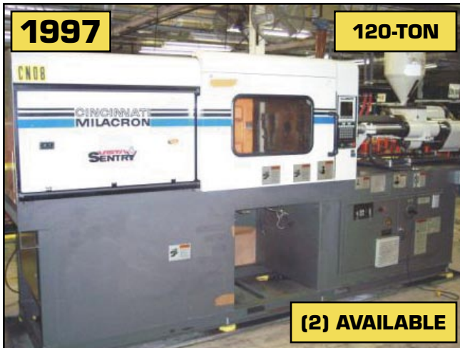
1997 Cincinnati VSX-120-9.59