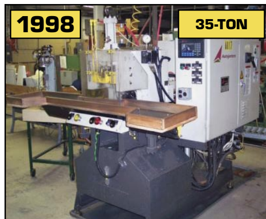
1998 Autoejector WDH5-35-S