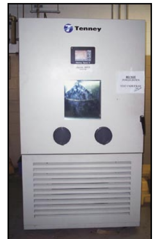
Tenney Test Chamber