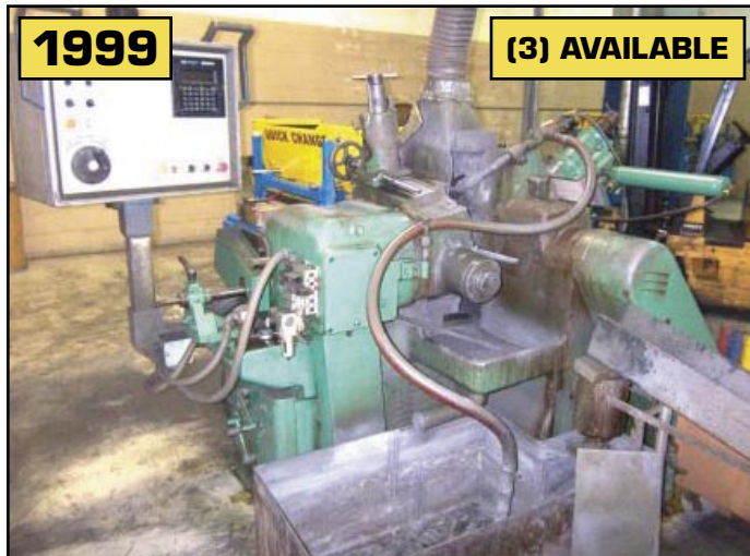
Cincinnati 2EA Centerless Grinder