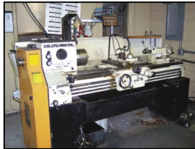
LeBlond Makino Engine Lathe

Also: Rotary Tables; Collet Indexers; Milling Vises; Die Lift Tables; Arbor Presses; Collets; Holddown Sets; Toolboxes; Maple Top Workbenches; Hand Tools; Taps; Drills; Pin Sets; Belt Sanders; 18" Rockwell Disc Sander; Chain Falls; Milling Cutters; Spacers; Storage Cabinets; Hardware; Econoline Bench-Type Shot Blast; Unitek MDL. I 132-C1-02 Bench Spot Welder; Lassy Tapper Stamp Sets; Angle Plate; Etc.