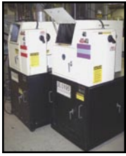
Ball & Jewel Granulators