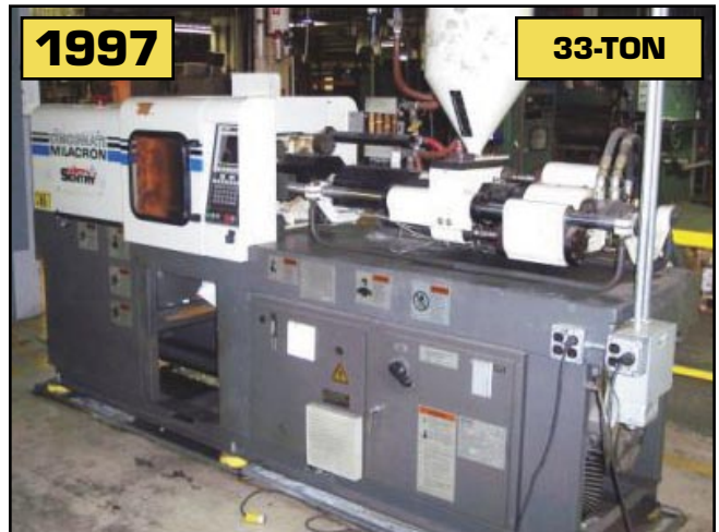
1997 Cincinnati VSX33-2.27