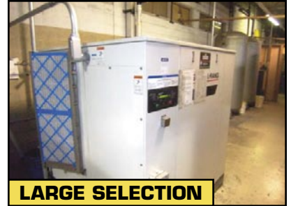
Ingersol 60 HP Air Compressor