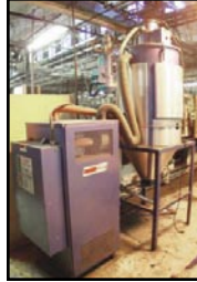
Portable Hoppers/ Dryers