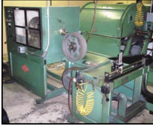
New England Wire Co. Twisters