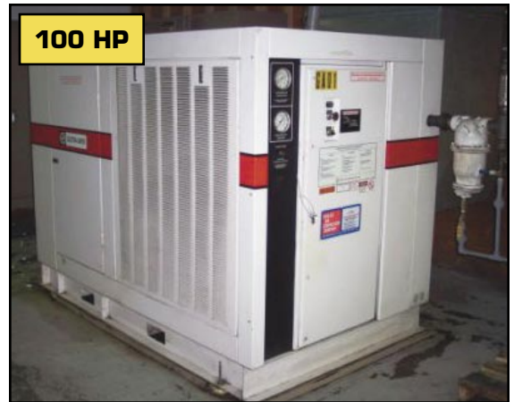
Gardner-Denver Rotary Screw Compressor

Stone MDL. SST-77 Vacuum Packaging Machine , 30" x 49" area, S/N CM3049P75J644