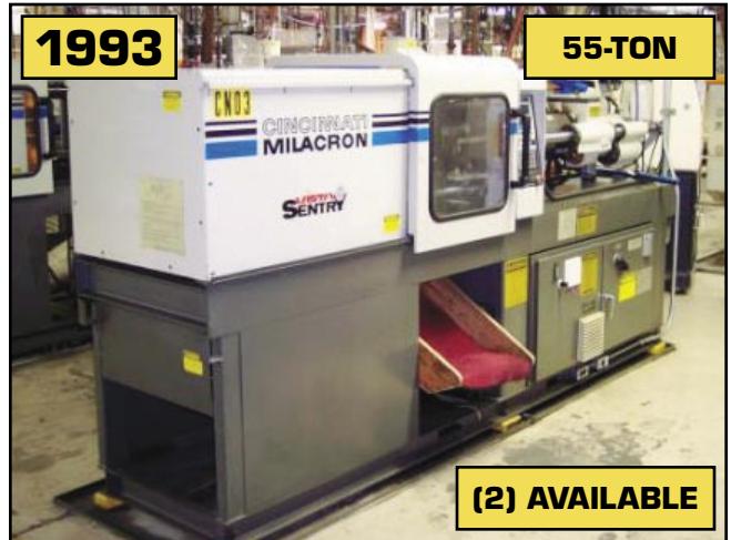
1993 Cincinnati VST-55-4.44