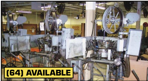
Eubanks 400-04-9915-173 Straightener