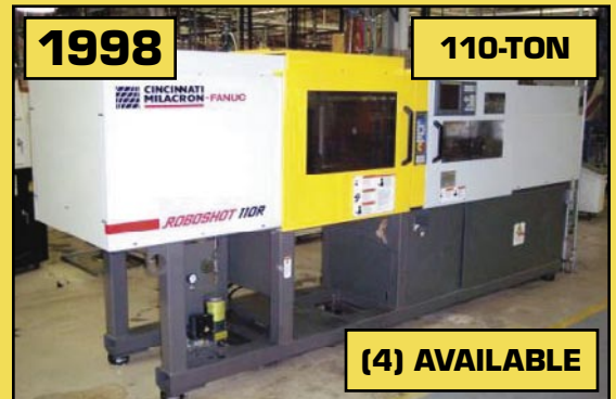
1998 Cincinnati Roboshot 110R