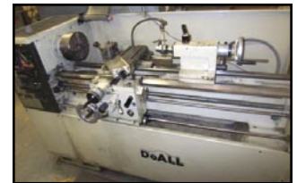
DoAll Engine Lathe