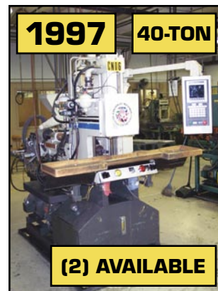
1997 Cincinnati Vector CH-40-S