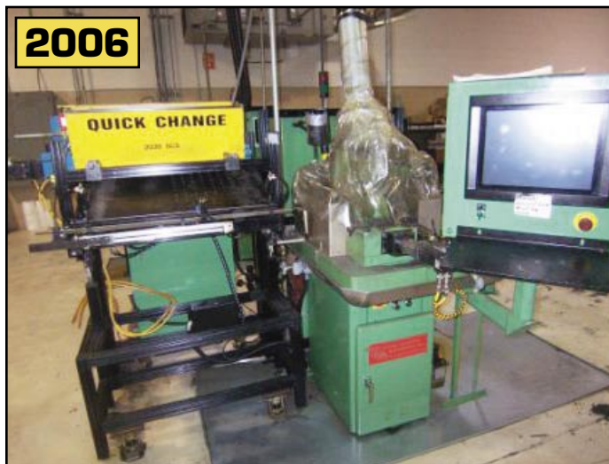
Royal Master T6-12 X4.5 Centerless Grinder