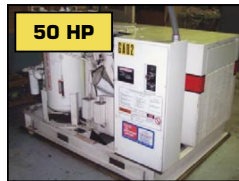
Gardner-Denver Air Compressor