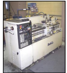
DoAll Engine Lathe