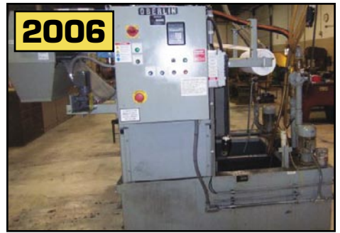
Oberlin OPF02 Filtration System