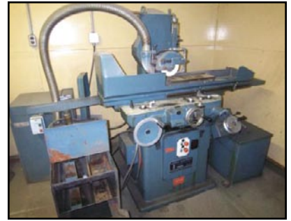
Jones & Shipman 6" x 18"

Tennant 3640 Electric Walk-Along Floor Sweeper, S/N 3640-6985