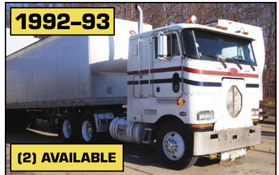
Peterbilt 362 Tractors