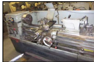
Colchester "Triumph 2000"