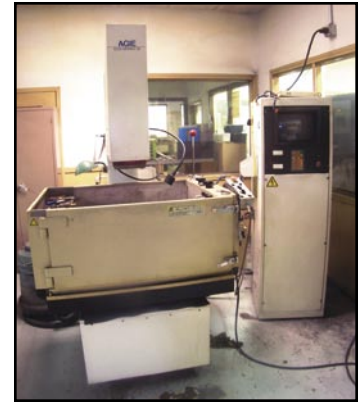
Agie-Elox "Mondo 38"