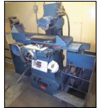
Jones & Shipman 8" x 24"