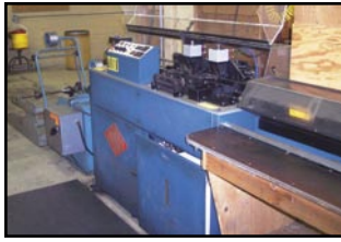
Artos CS-27 Stripper