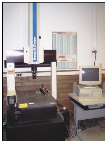
Brown & Sharpe CMM

Bodine MDL. 48-20 Combination Vertical & Horizontal Drilling Machine, Indexing Table, S/N 424518