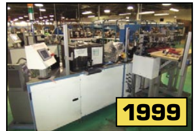
Robotic Process Assembly Machine