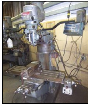
Bridgeport Series I