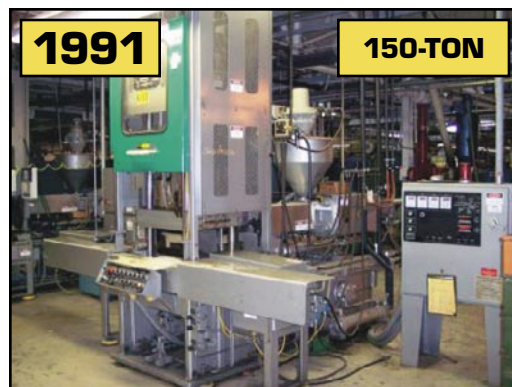
1991 Newbury V15-150ARS