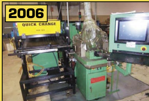
Royal Master T6-12 X4.5 Centerless Grinder