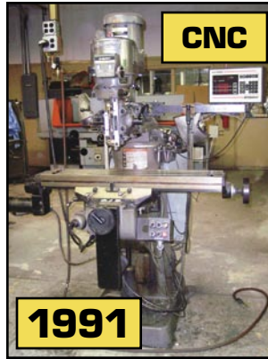
1991 Bridgeport EZ-TRAK