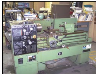
Nordini Engine Lathe