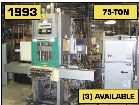
1993 Newbury V9-75BRS