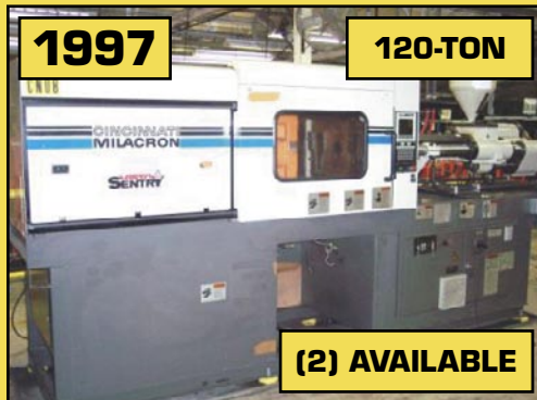
1997 Cincinnati VSX-120-9.5