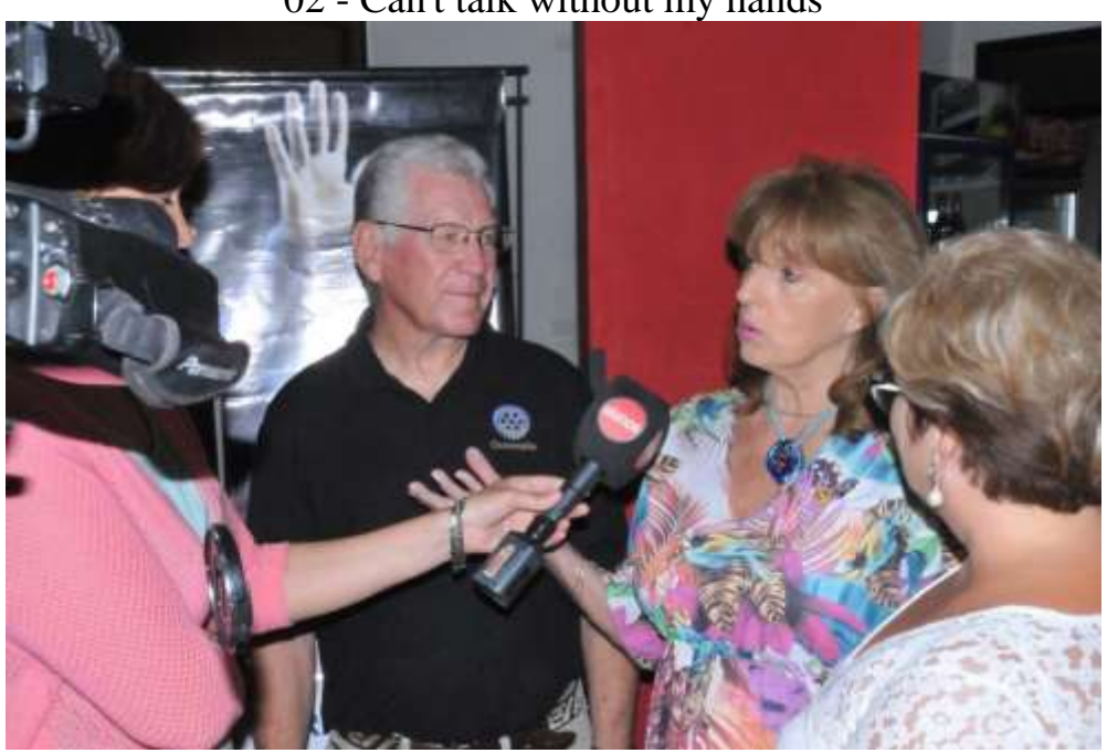
03 - One of two live television interviews.