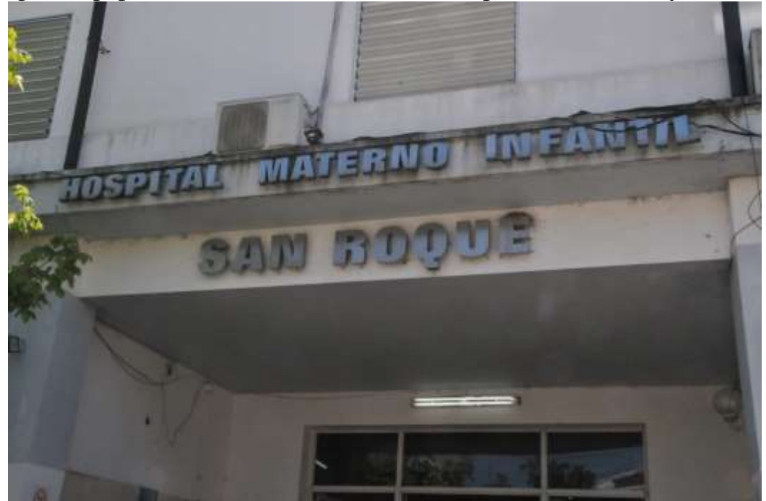
05 - Infant Hospital in Parana, Entre Rios, Argentina.

This is the project for which we have agreed to donate $1,000 from our club. I am bringing back paperwork and the information to explain to the Rotary Board.