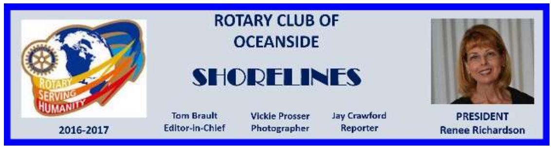
February 10, 2017