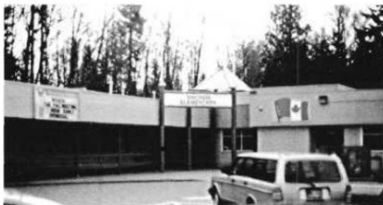
Simonds Elementary in 1974 (left) and Simonds U-Connect 2020 (right).