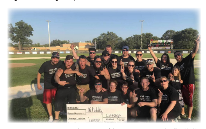
Lineage Logistics' team were the winners of the 2019 Campaign Kick Off Kickball Tournament.

Verso Corporation - Stevens Point Mill Village of Plover Washington Elementary Welling Kitchens Worth Company Wysocki Family of Companies