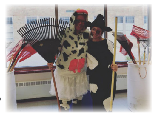
Employees at Biery Cheese dressed as cows to help "moo-ve" leaves for the 2019 Make A Difference Day rake-a-thon.

Donations for the 2019 campaign totaled $1,266,110 or 40% of the overall campaign