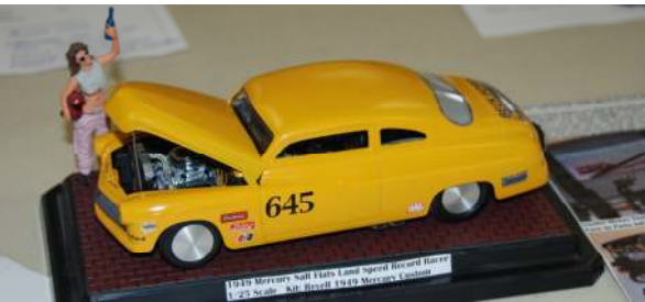
The Merc on the contest table at the Rockford Classic Plastic event.

Overall I was happy with the results. The kit is nice, everything fits great. The paint could have been a bit smoother, but I was under a deadline. But this way it looks like a low budget private race team, common in this type of racing. Since I am no expert on Salts Flats racing I am sure some technical aspects are incorrect, but it looks ok to me.