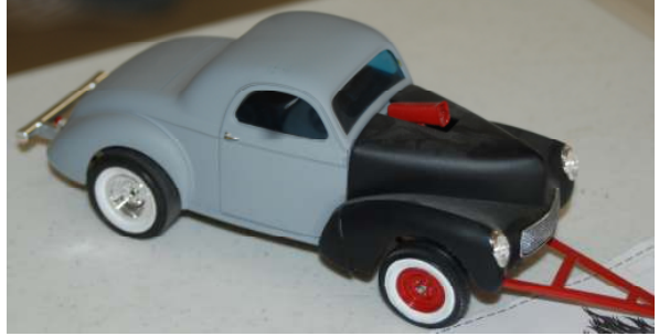
Best Theme: Nostalgia Drag