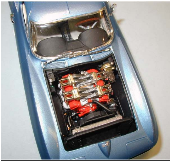
Final Opinion: This model builds into a very nice replica of the 67 Coupe; overall I am very pleased with the overall look and 'feel' of the completed kit. Revell is doing the right thing in my opinion by adding new/modern/retro features to their existing model line up and including more extensive decal sheets. To me this helps sooth the pain somewhat of their increased MSRP kit prices. If you are into Stingrays and Grand Sports, this little number is for you.

stir the brush into a small dab of glue to water it down and then brush it on...works like a charm. Some of the smaller chrome and clear bits were a little fiddlely because the parts required cleanup and silver paint touch-up before assembly.