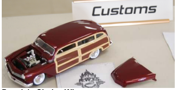
People's Choice Winner

In a change from past shows, rather then judging by category, there were two trophies awarded by popular vote.