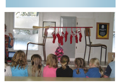
1st Chase River Sparks at their Sparks go Wild Mom and Me camp