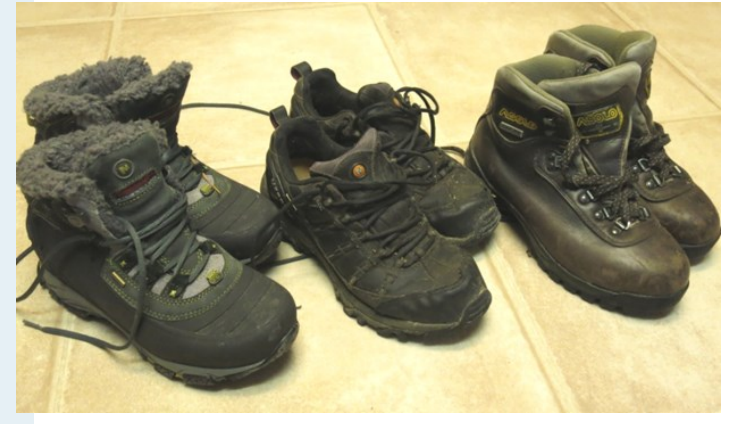
"Oh, the happy trails we've traveled!"

There are very few things as wonderful as a really good pair of boots. There are various boots for various different situations but you won't be happy with any of them if they don't fit properly. If you are not confident in your knowledge of buying boots, be sure to go to a store that has the knowledge and is willing to take the time to help you. Some things to consider in the whole process are: the fit, your intended use and what you are able to spend.