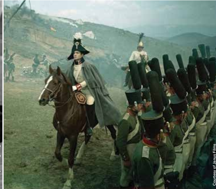
"Spiked with bittersweet humor and even a gentle, surprising hint of sentimentality." —Guy Lodge, Variety