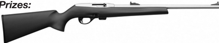
Remington Model 597 Gander Mountain Exclusive .22 cal. Autoloader