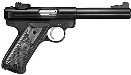
Table Captains Gun Drawing

Ruger MKIII 60th Anniversary .22cal. Pistol