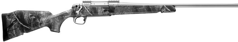
Smith & Wesson I Bolt Rifle in 30-06 Cal