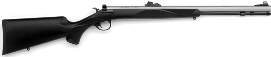
Traditions Yukon 50cal. Muzzleloading Rifle