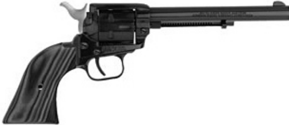
Heritage Rough Rider .22/.22 Mag Revolver with Display Case