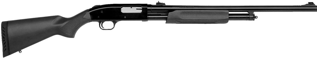
Mossburg 500 Crown Grade 12ga. Pump Shotgun