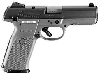
Ruger SR-9 Autoloading Pistol in 9mm, 17 shot cap.