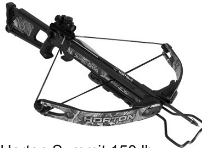
Horton Summit 150 lb. Red Dot Crossbow Package