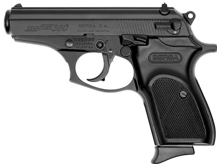
Gander Mountain Exclusive Bersa Thunder Lite .380 ACP