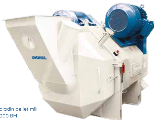
Paladin pellet mill 2000 BM