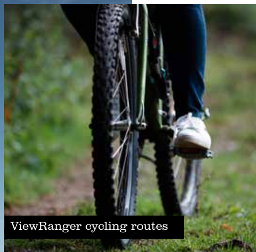
ViewRanger cycling routes