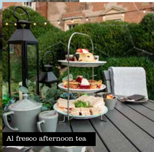
Al fresco afternoon tea

Book ONLINE TODAY or call us on 0330 100 9774