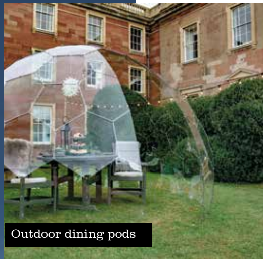
Outdoor dining pods

We're inviting fewer guests for safe social distancing, so get a date in the diary now for the best availability at the lowest price. Our free Coronavirus Guarantee allows you to book now and change later for total peace of mind.