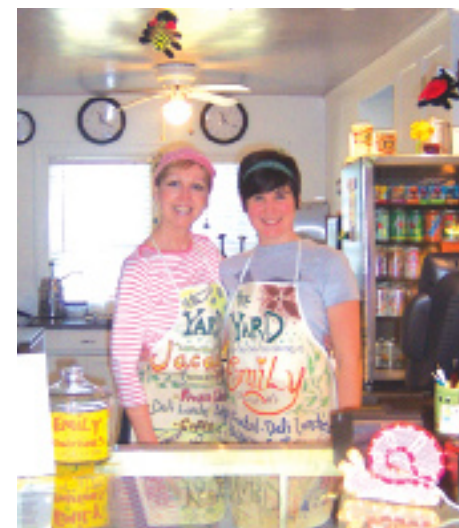
Two of the owners of The Yard.

The Yard is famous for one special sweet: their frozen custard. The custard flavors include chocolate and vanilla and is home made in the shop. If you want to know more about the menu, hours, or activities, you can go to their website www.theyardshops.com .