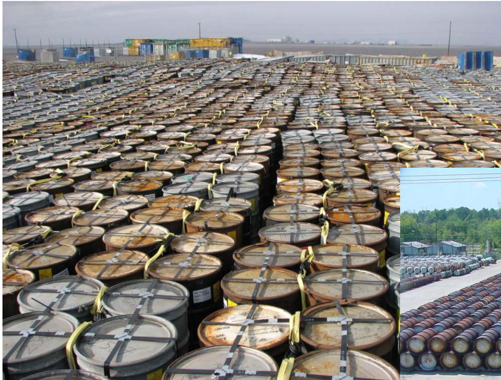
DU trioxide from the Savannah River Site