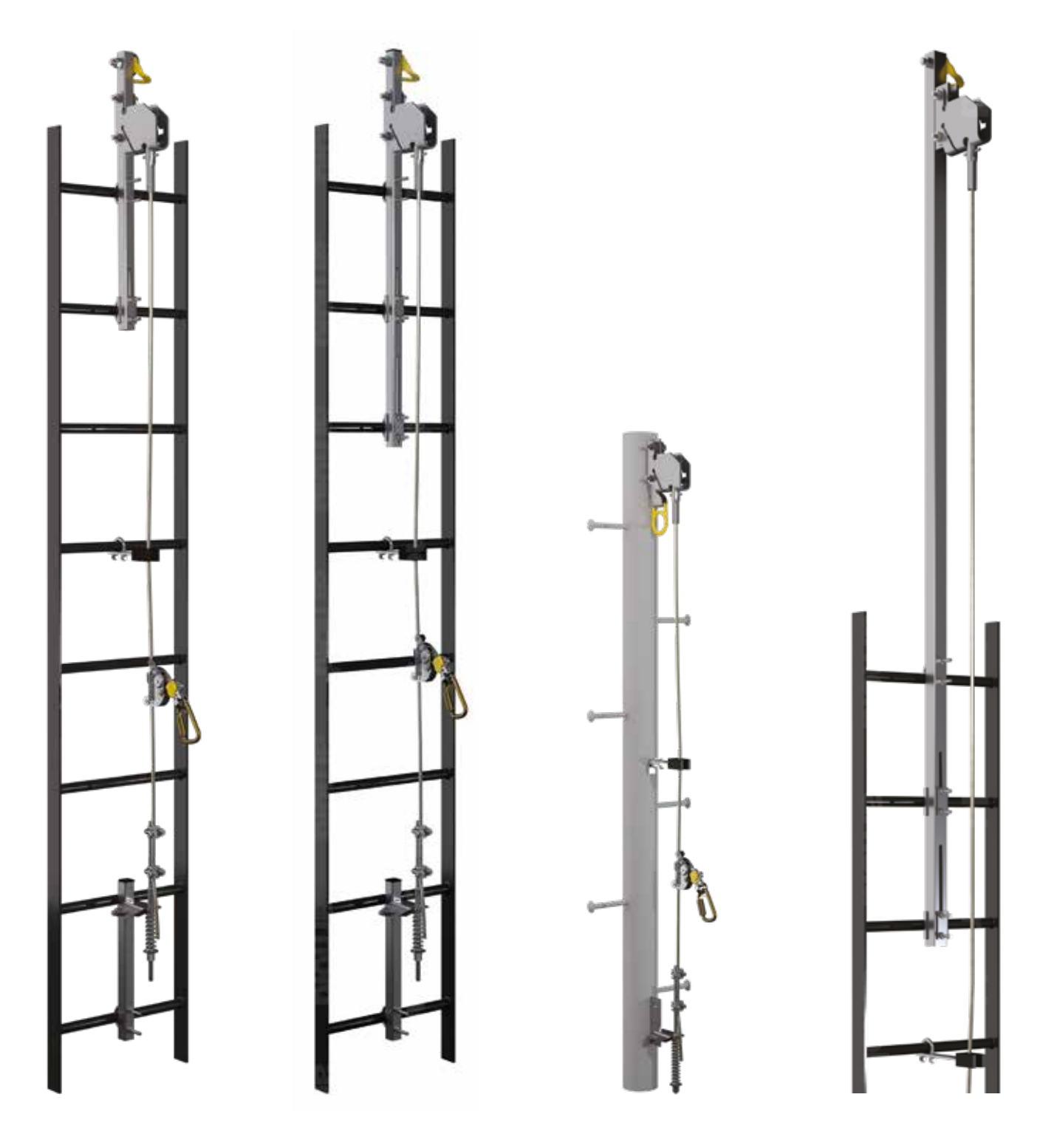
Rung, 2 User Stainless Steel - <u>6116632</u> Rung, 2 User Galvanized Steel - <u>6116631</u>