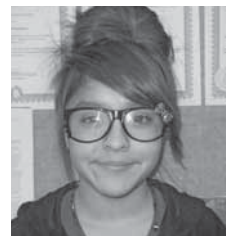
December 2012, Alternative HS: