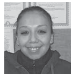
December 2012, Adult Ed: