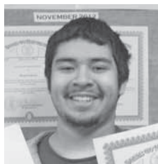
November 2012, Alternative HS: