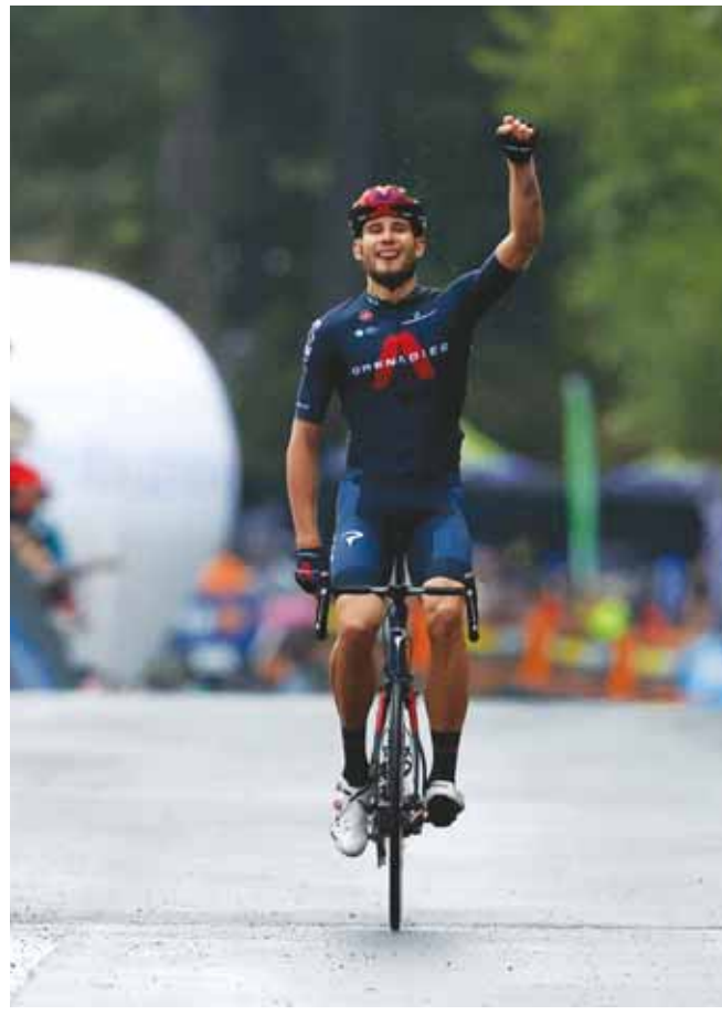
Team Ineos rider Filippo Ganna of Italy celebrates as he crosses the finish line to win the fifth stage of the Giro d'Italia, a 225-kilometre route between Mileto and Camigliatello Silano, yesterday.