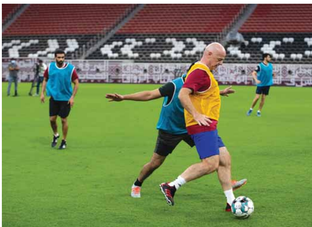
FIFA President Gianni Infantino in action during a friendly seven-a-side match at Al Bayt Stadium yesterday.

"Al Bayt Stadium is incredible, a true football stadium. It has a real football feel and a local touch. The tented shape makes it truly unique, and the Arabic patterns in the roof are just beautiful. I am speechless."