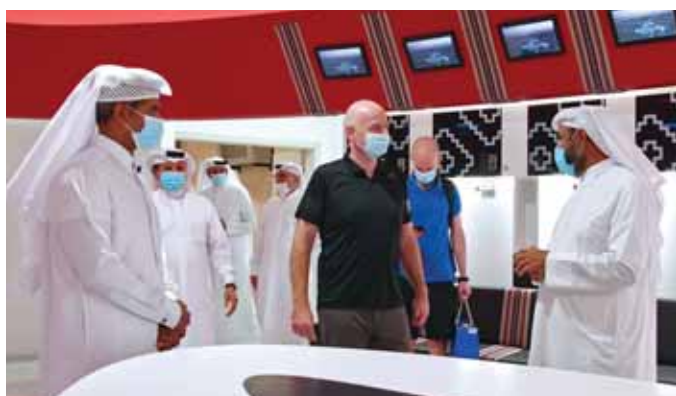
FIFA President Gianni Infantino was given a tour of Al Bayt Stadium in Al Khor yesterday.