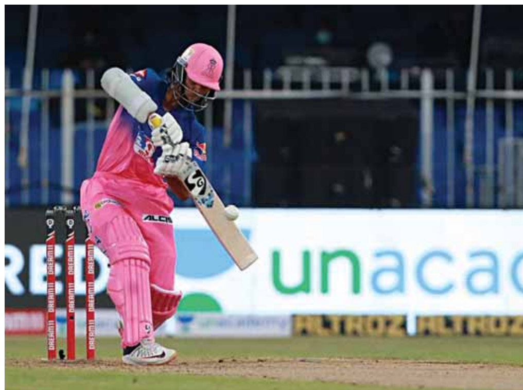
Rajasthan Royals' Yashasvi Jaiswal plays a shot during their Indian Premier League match against Chennai Super Kings held in Sharjah September 24, 2020.

"My focus is to work on things I can control and not worry too much about the future."