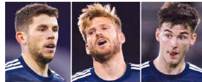
Ryan Christie (left), Kieran Tierney (right) and Stuart Armstrong.

"It is something that is there, it is in everyone's lives now, we have to adapt as much as we can and be prepared for," said Clarke. "I tell the players that they have to be ready to step in at any time because we need everybody."