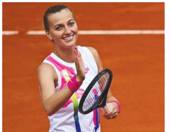
Czech Republic's Petra Kvitova celebrates after winning the French Open quarter-final against Germany's Laura Siegemund (not pictured) at Roland Garros in Paris, France, yesterday.

"I'm really proud of her. Especially here, the emotions you can see after her last match, all the memories coming back."