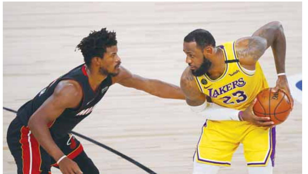
Jimmy Butler of the Miami Heat (L) tries to stop LeBron James of the Los Angeles Lakers on Tuesday.