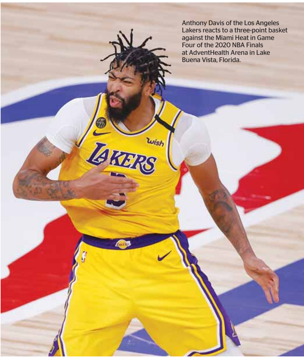
Anthony Davis of the Los Angeles Lakers reacts to a three-point basket against the Miami Heat in Game Four of the 2020 NBA Finals at AdventHealth Arena in Lake Buena Vista, Florida.

An attritional contest saw defenses on top throughout