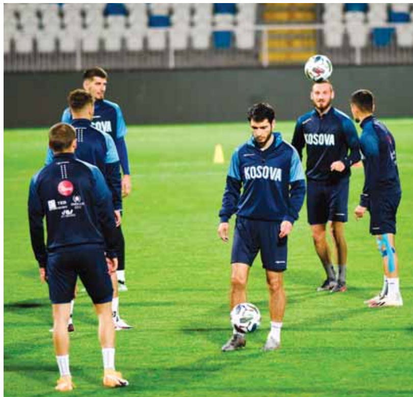
Kosovo's team players attend a training session in Pristina on October 5, 2020.

If Kosovo win today they will still have one more hurdle before they reach the Euros - a play-off final against either Georgia or Belarus.