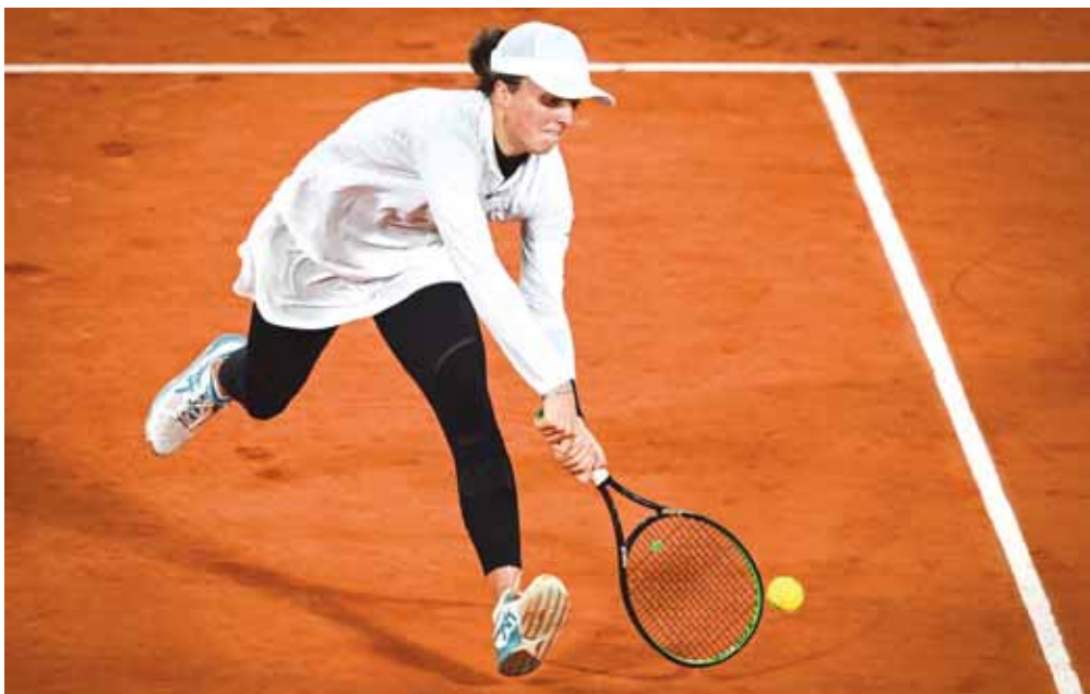
Poland's Iga Swiatek returns the ball to Italy's Martina Trevisan (not pictured) during their French Open quarter-final at Roland Garros in Paris, France, on Tuesday.

"Actually I wanted to change it because right now it's kind of boring to listen every day to the same song. But yeah, I stayed