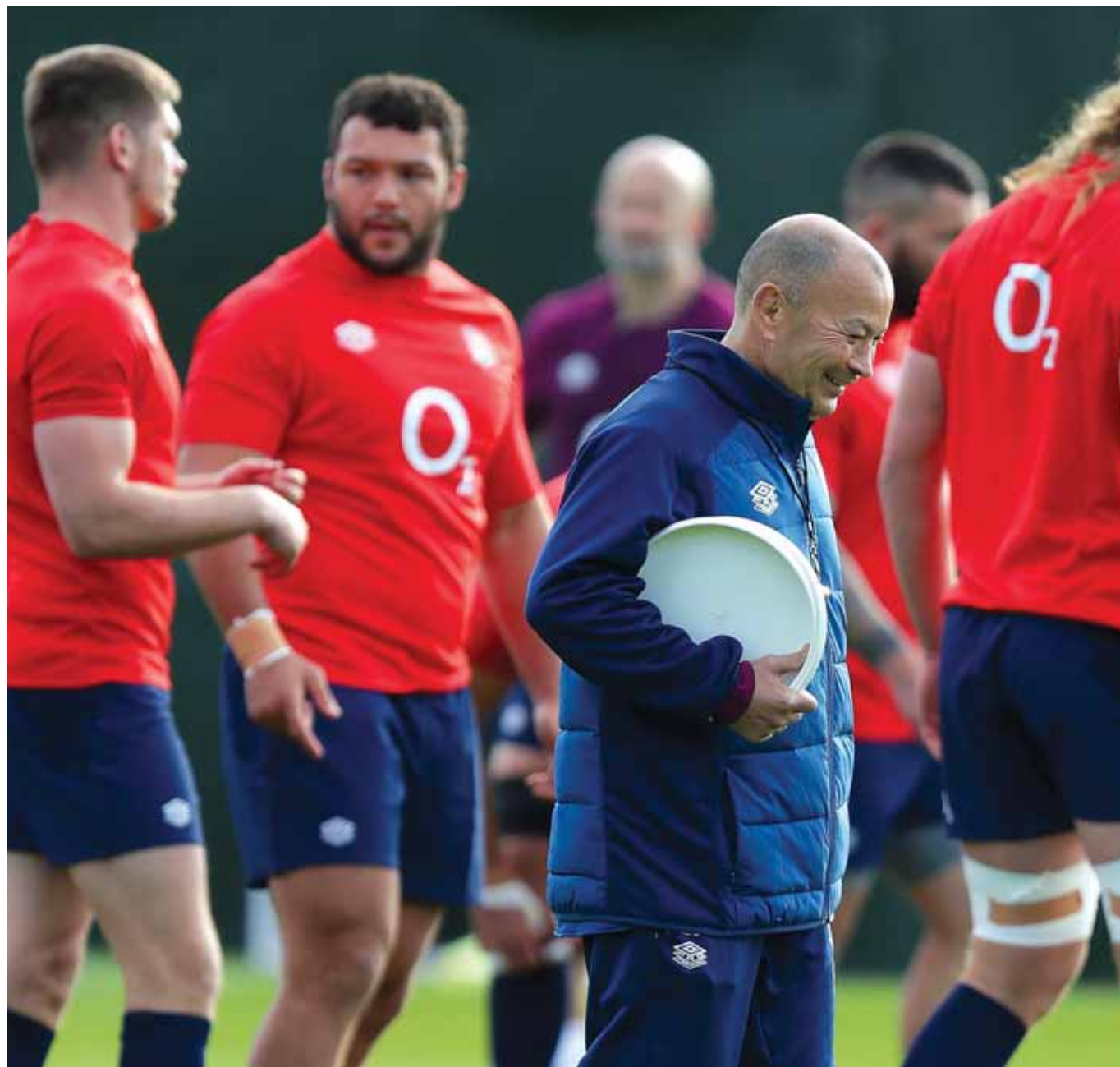
England's coach Eddie Jones reacts during team's three-day training camp at The Lensbury in Teddington, London, yesterday.