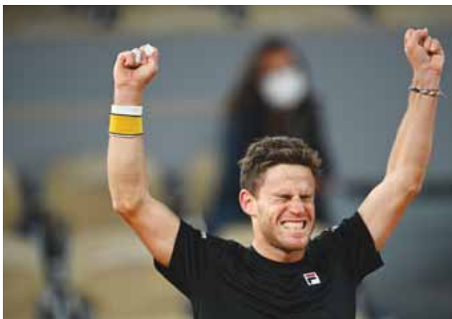
Argentina's Diego Schwartzman (also above) celebrates his French Open quarter-final win over Austria's Dominic Thiem (not pictured) at Roland Garros in Paris, France, on Tuesday.

ported goods was badly hit by economic reforms. Schwartzman, named after