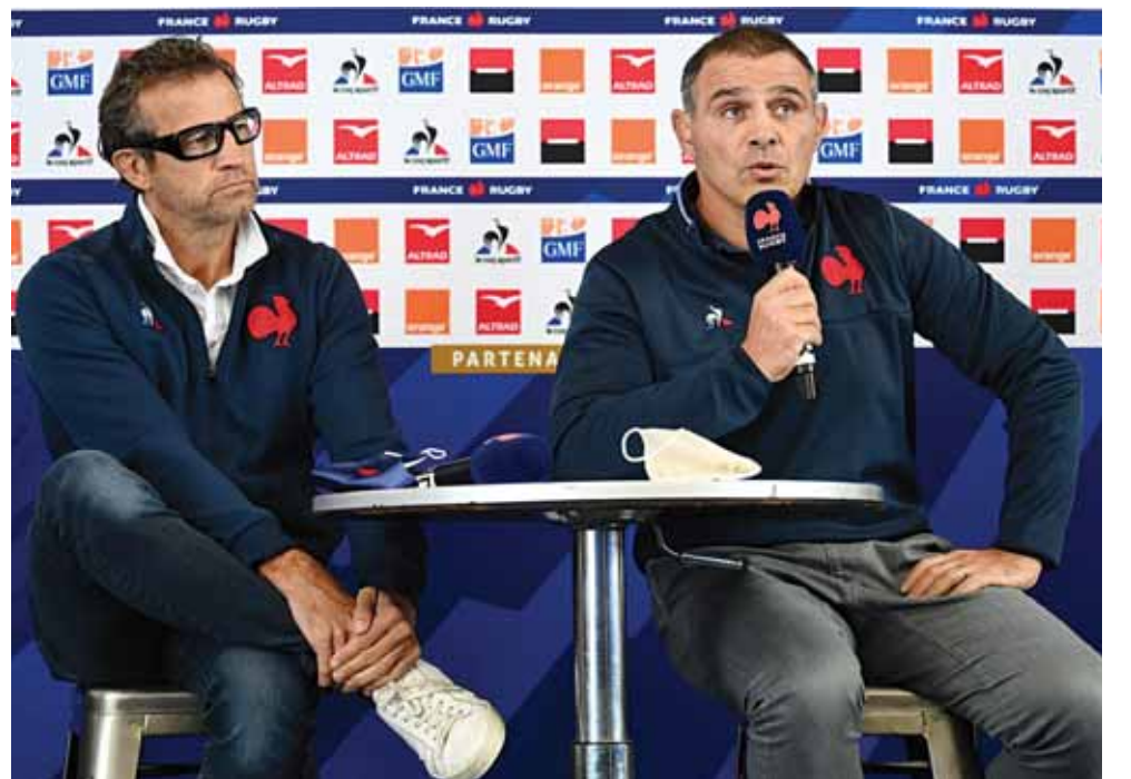
France's rugby union team general manager Raphael Ibanez (right) speaks next to head coach Fabien Galthie during a press conference to unveil the squad for the upcoming matches in Marcoussis.

Backs: Antoine Dupont (Toulouse), Baptiste Serin (Toulon), Romain Ntamack (Toulouse), Matthieu Jalibert (Bordeaux-Begles), Virimi Vakatawa (Racing 92), Arthur Vincent (Montpellier), Gael Fickou (Stade Francais), Olivier Klemenczak (Racing 92), Vincent Rattiez (Montpellier), Arthur Retiere (La Rochelle), Teddy Thomas (Racing 92), Anthony Bouthier (Montpellier), Thomas Ramos (Toulouse)