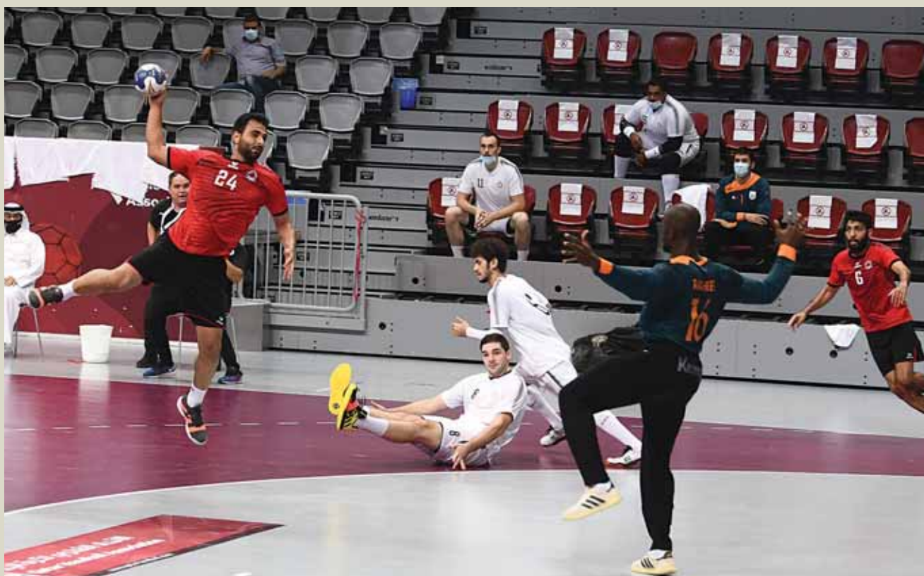
Action from the match between Al Rayyan (in red and black) and Al Sadd (in white) during their Amir Cup handball tournament match yesterday. Al Rayyan won the game 31-29 to reach the next round. (Right) Al Duhail (in red) beat Qatar Sports Club (in yellow and black) 24-19 in their match to advance.