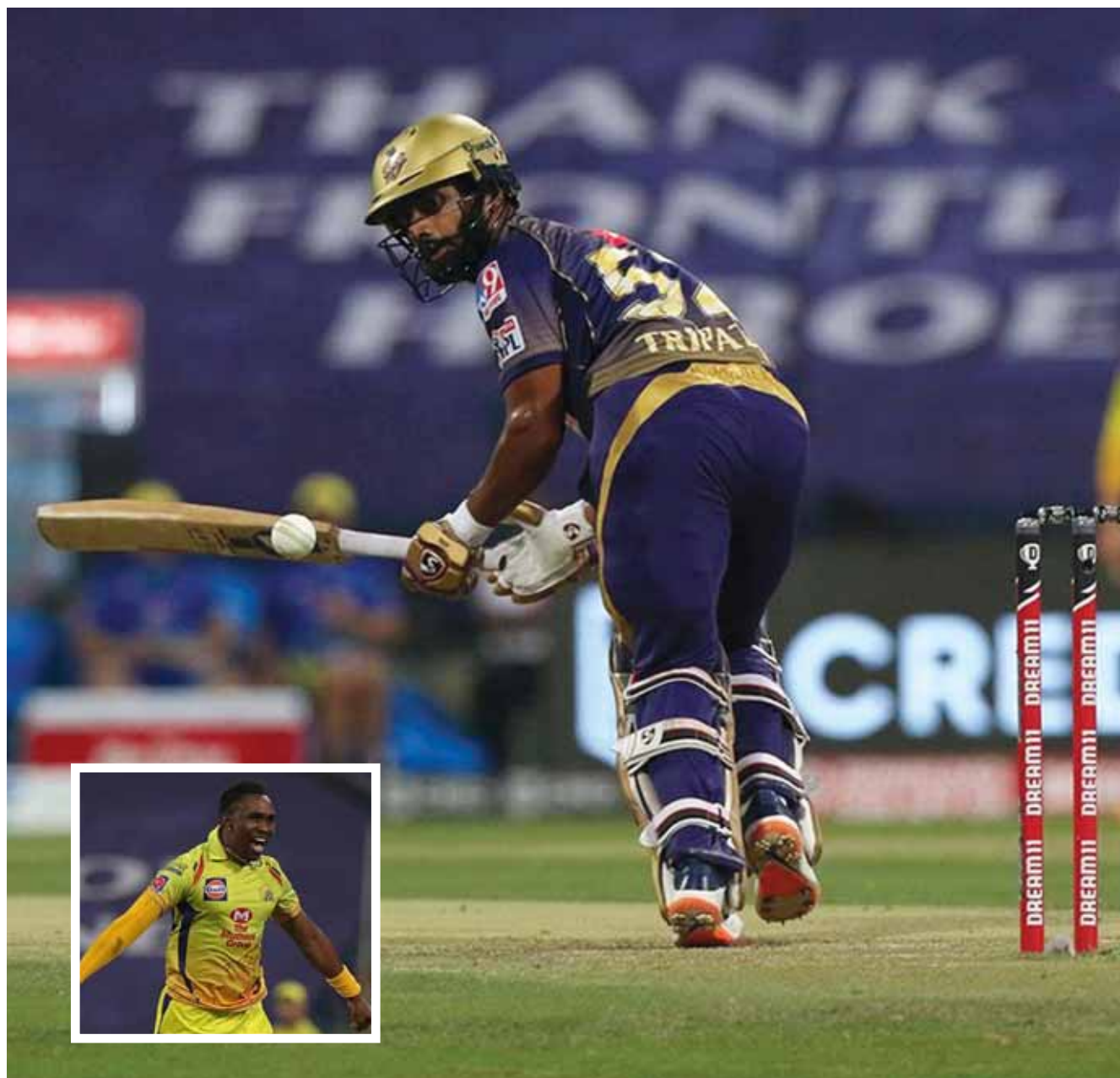
Rahul Tripathi of Kolkata Knight Riders in action during their Indian Premier League match against Chennai Super Kings in Abu Dhabi yesterday. (Inset) Birthday boy Dwayne Bravo.

BRIEF SCORES: KKR 167 all out (Tripathi 81, Bravo 3-37) beat Chennai Super Kings 157 for 5 (Watson 50, Russell 1-18) by 10 runs