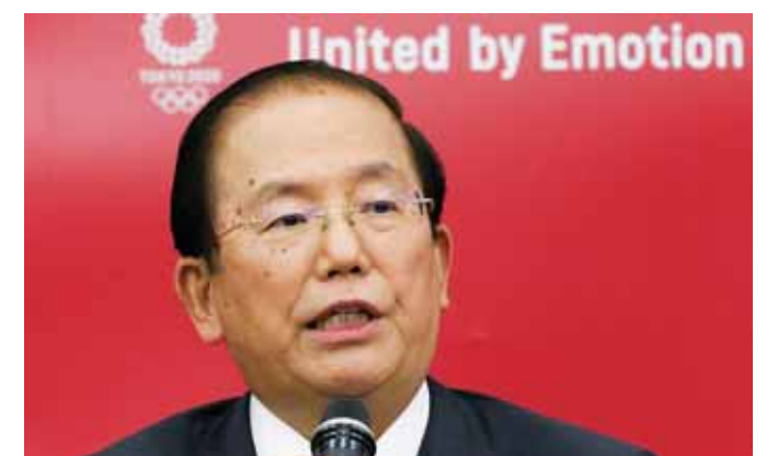
Tokyo 2020 Olympic Games CEO Toshiro Muto speaks during a press conference in Tokyo yesterday.