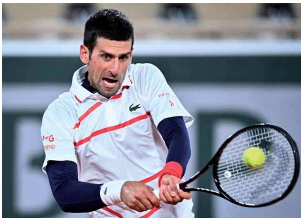
Serbia's Novak Djokovic returns the ball to Spain's Pablo Carreno Busta (not pictured) during their French Open quarter-final at Roland Garros in Paris, France, yesterday.

In the women's draw, fourth seed Sofia Kenin claimed her maiden French Open semi-final spot as