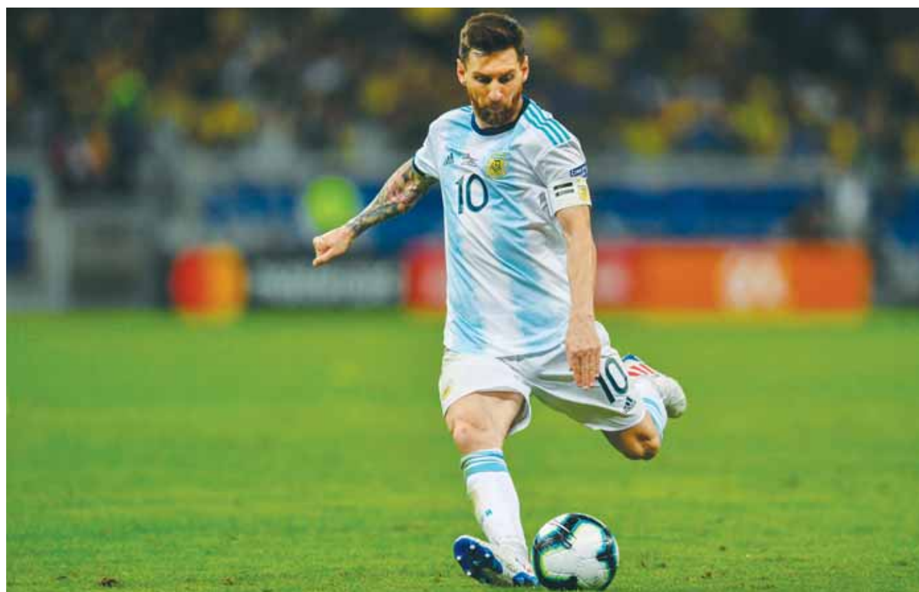
In this file photo taken on July 2, 2019, Argentina's Lionel Messi strikes the ball during the Copa America semi-final against Brazil at the Mineirao Stadium in Belo Horizonte, Brazil.

It took a hat-trick by an inspired Messi in Argentina's final qualifier - away to Ecuador - to send the twice world champions