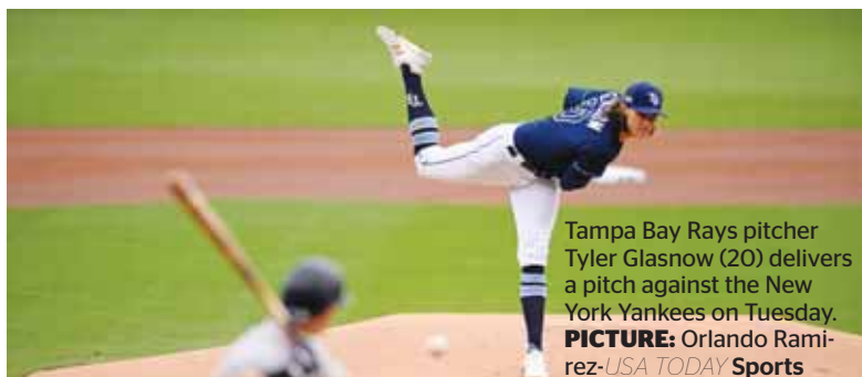
Tampa Bay Rays pitcher Tyler Glasnow (20) delivers a pitch against the New York Yankees on Tuesday.

New York star Giancarlo Stanton homered in his fourth consecutive playoff game, including a towering 460-foot, three-run drive that cleared the upper deck in the fourth inning.