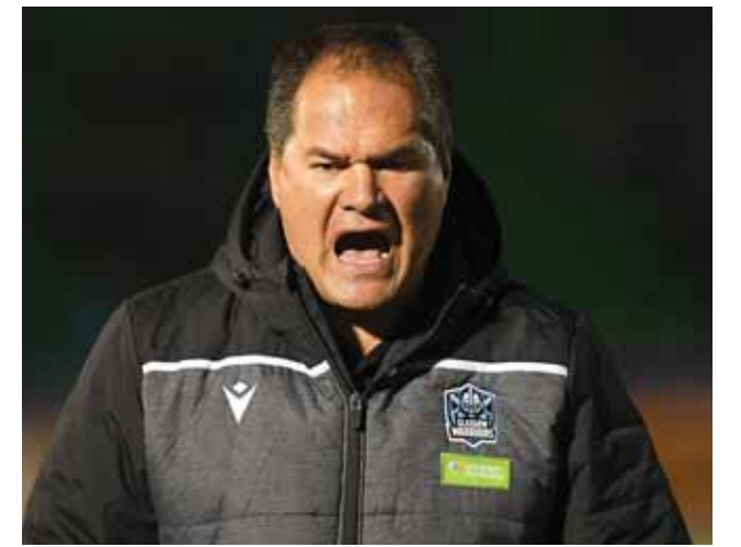
Wallabies' coach Dave Rennie.

"(Our knowledge of Rennie) helps but there's still a lot of question marks in terms of what they'll bring."