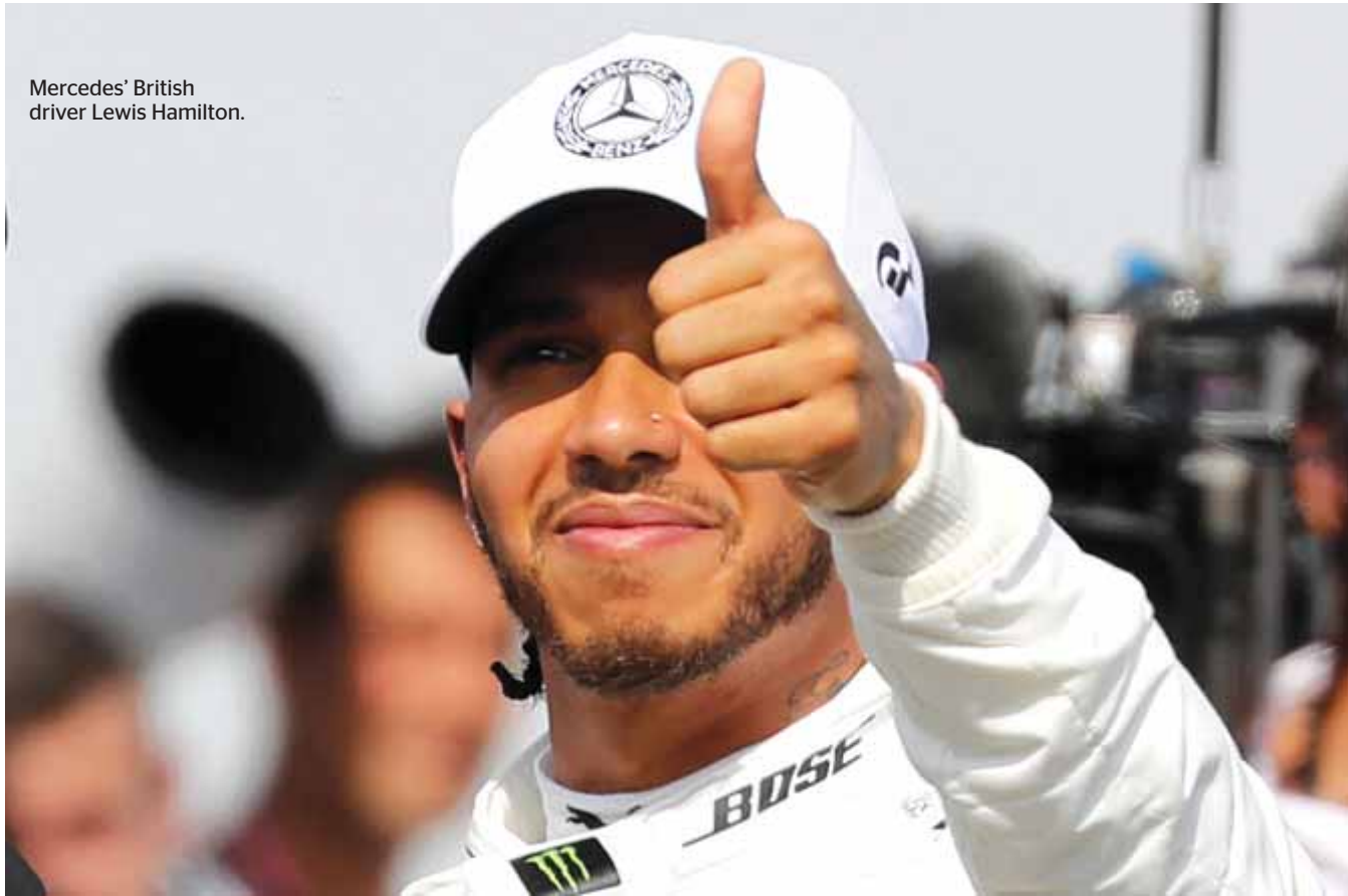
Mercedes' British driver Lewis Hamilton.

The session has an added poignancy, Mick lapping at the German circuit closest to his father's boyhood home in Kerpen and one where Michael - who