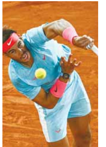
Spain's Rafael Nadal serves the ball to Italy's Jannik Sinner (not pictured) during their French Open quarter-final on Tuesday.

"We learned from that moment and now he is at a great level with many more games played. It will be a tough mental battle and I think we have some weapons that will allow Rafa to compete with guarantees."