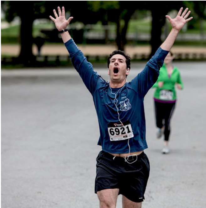
Close to a Cure raised $25,208 to support the Mayo Clinic in finding a cure for melanoma.