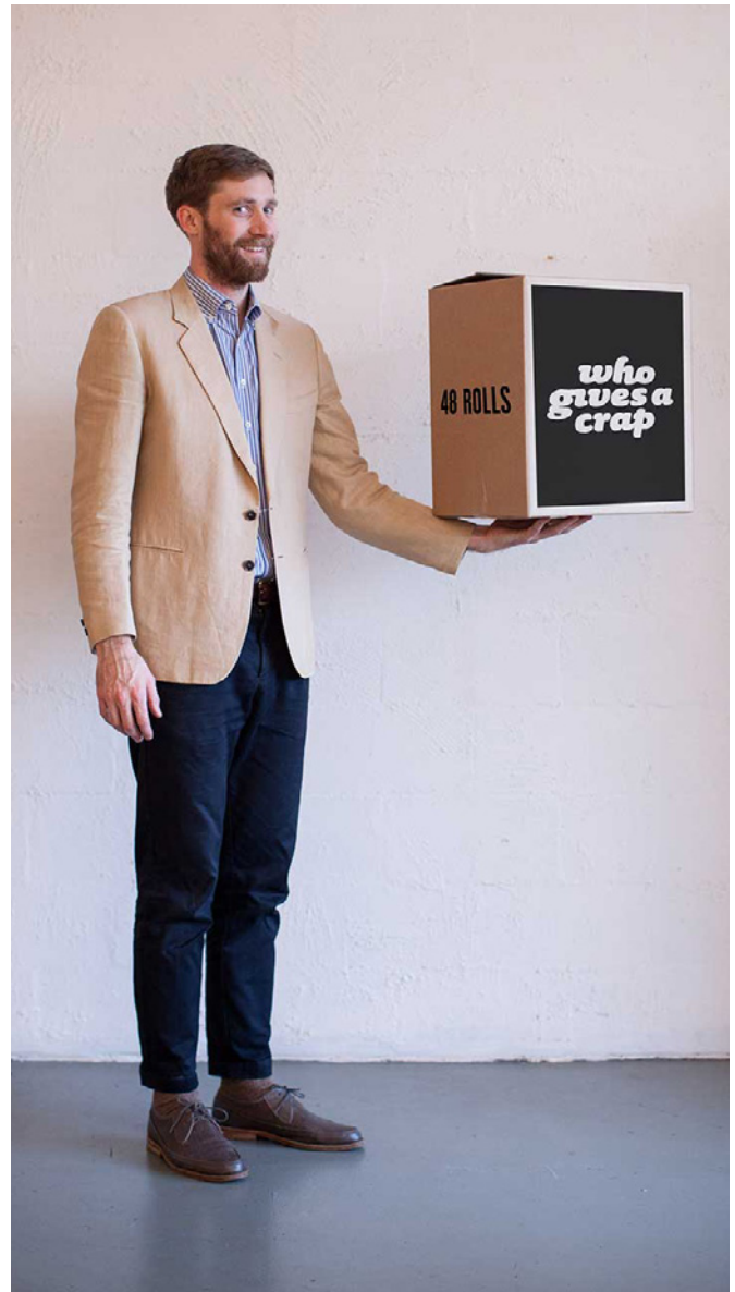
Who Gives A Crap —toilet paper that builds toilets, raised $66,548 to fund their first bulk toilet paper production run.

“I won’t get off the toilet until we’ve raised $50,000 - and I’m going to livestream the whole thing.” 33