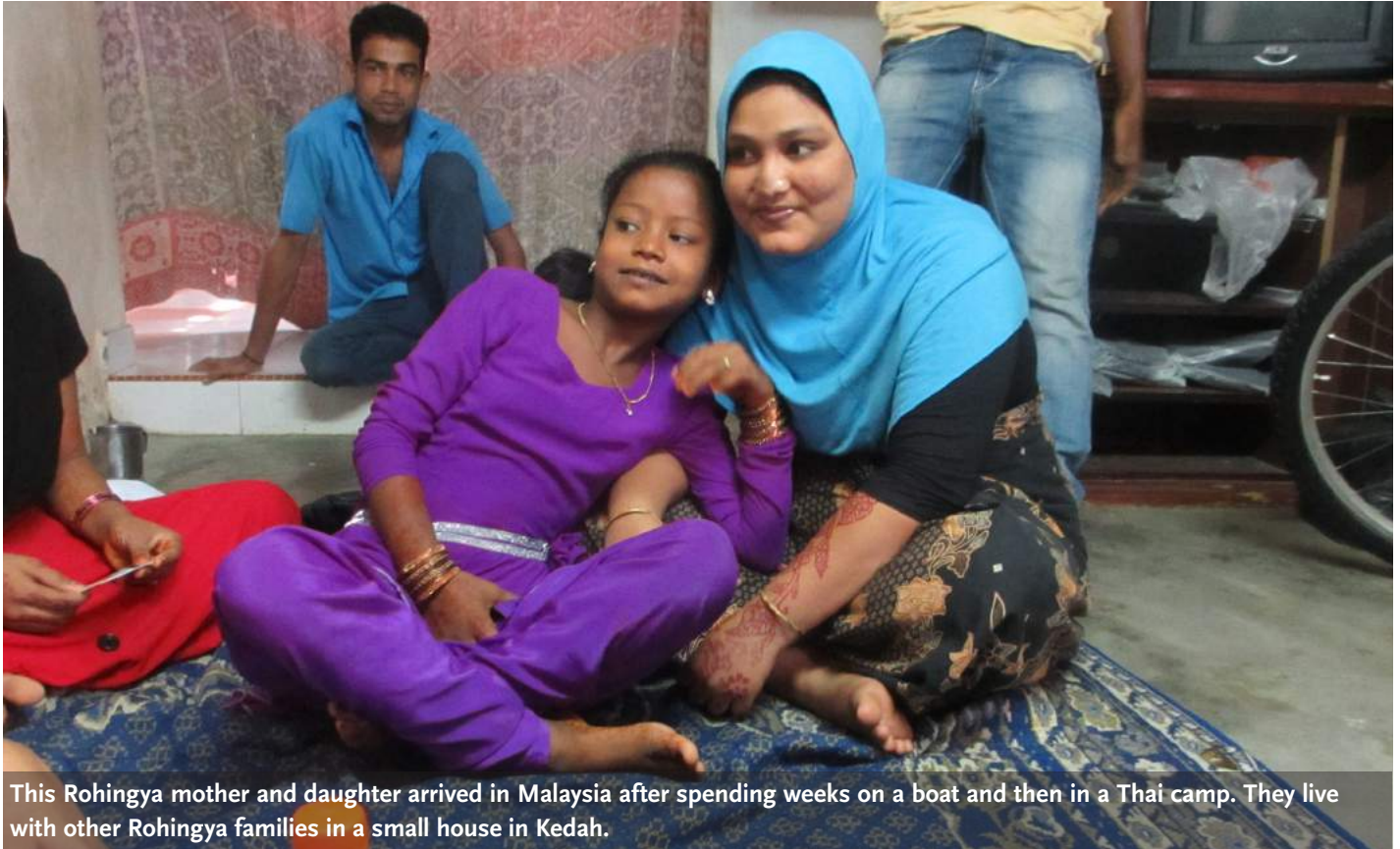
This Rohingya mother and daughter arrived in Malaysia after spending weeks on a boat and then in a Thai camp. They live with other Rohingya families in a small house in Kedah.

not disembark passengers, as Thai smugglers and traffickers on land would no longer assist with disembarkation, being at risk of arrest. The flight of the Rohingya is decades-old, and while this year's exodus was the largest on record, it would not have become visible if the smuggling crackdown had not occurred. Indeed, while the increased numbers were new, the horrors experienced by the Rohingya at sea and in smuggling camps were not.