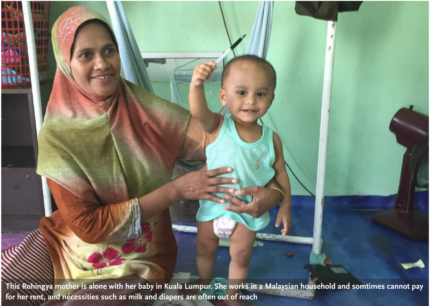
This Rohingya mother is alone with her baby in Kuala Lumpur. She works in a Malaysian household and sometimes cannot pay for her rent, and necessities such as milk and diapers are often out of reach

employers accountable for exploiting them, including through bribes, sexual and physical violence, or other criminal acts. Malaysia is a signatory to the Convention on the Rights of the Child (CRC) and therefore has agreed to protect all children from discrimination regardless of immigration status, among other obligations. And while Malaysia inserted a reservation to Article 7 of the CRC, which obligates states to register new births and confer nationality, Malaysia's Federal Constitution is consistent with this obligation, providing that citizenship be extended to children born in the Malaysian Federation who cannot acquire citizenship of another country by registration within one year of birth. 8 Yet, there are second and third generation Rohingya who were born in Malaysia, have lived in the country their whole lives, but remain stateless and without access to any of the rights and services provided to citizens, including education and health care. In line with Malaysia's Federal Constitution, the nation should recognize Rohingya children as citizens by operation of law if they were born in the Malaysian Federation and cannot acquire citizenship of another country by registration within one year of birth – which will be applicable in almost all cases of Rohingya births in Malaysia.