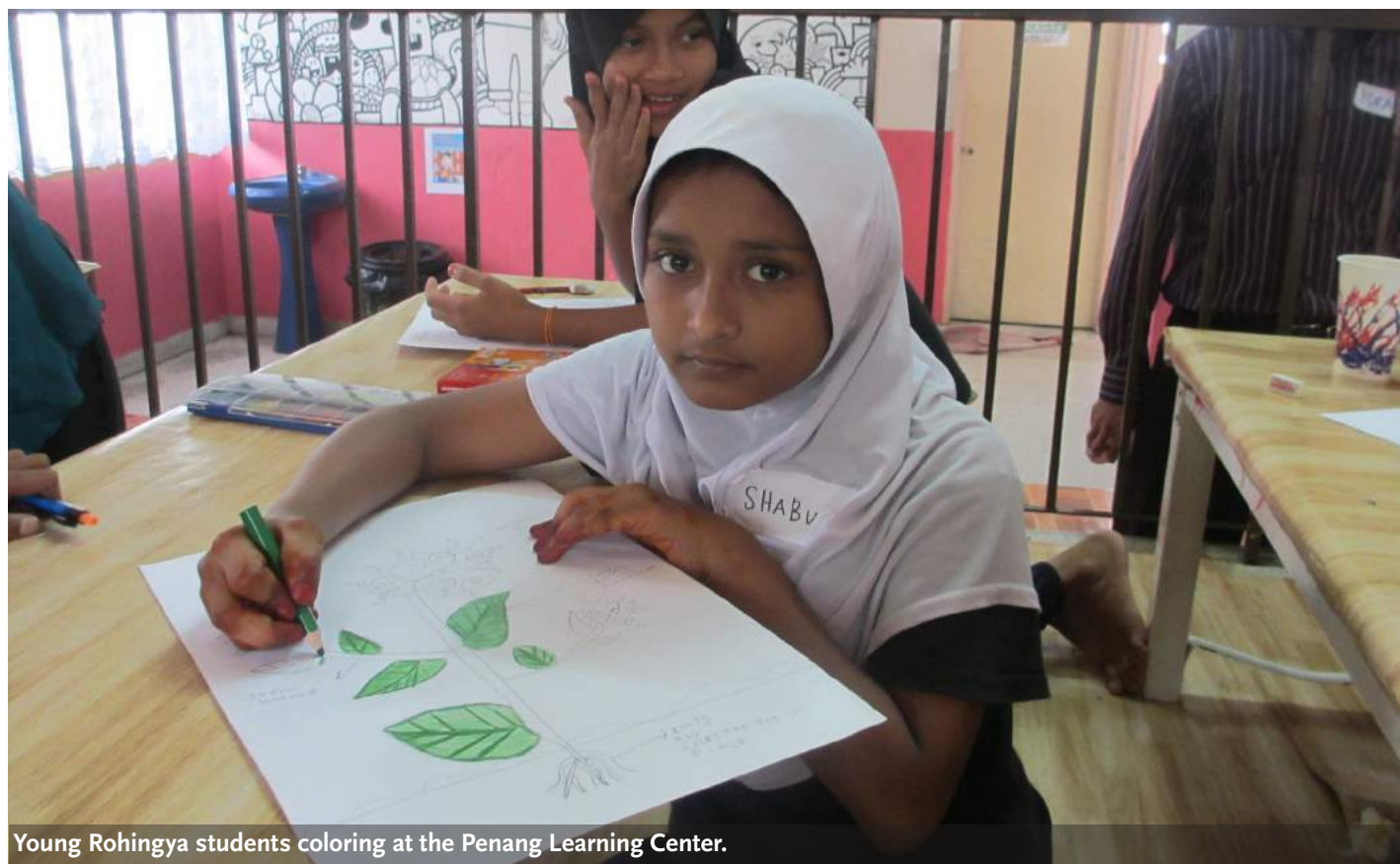
Young Rohingya students coloring at the Penang Learning Center.

to access this subsidy, although there were a few registered refugees who were not. The importance of the 50 percent subsidy could not be overstated, even when health care remained financially out of reach for most refugees. RI was told that for many families, the subsidy made the difference between going to the doctor for an injury and just bearing with the pain and infection until it healed at home. It also ensured that babies and children received timely vaccinations and pregnant mothers