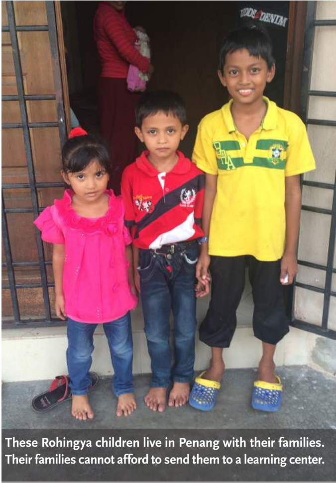
These Rohingya children live in Penang with their families. Their families cannot afford to send them to a learning center.

Rohingya working in the informal market make between 25 and 50 Ringgit per day (about $5 to $10), but work is irregular. And while some companies will only hire those Rohingya with a UNHCR card, this does not necessarily correlate with better work conditions or pay. This preference does reinforce the importance of being registered with UNHCR.