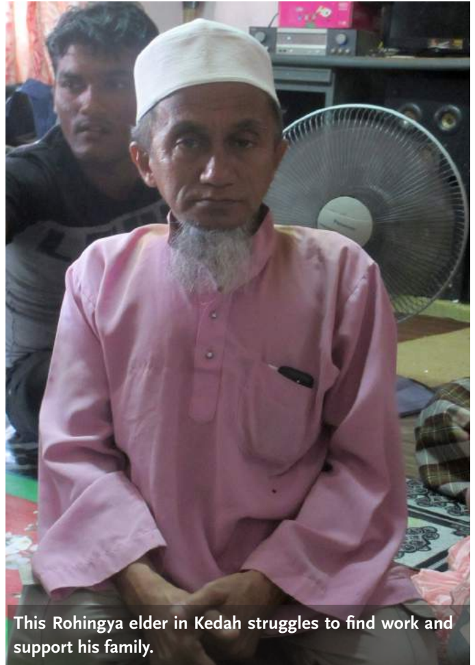
This Rohingya elder in Kedah struggles to find work and support his family.

“We don’t go out at all. Just this house or across the street – that’s it.”