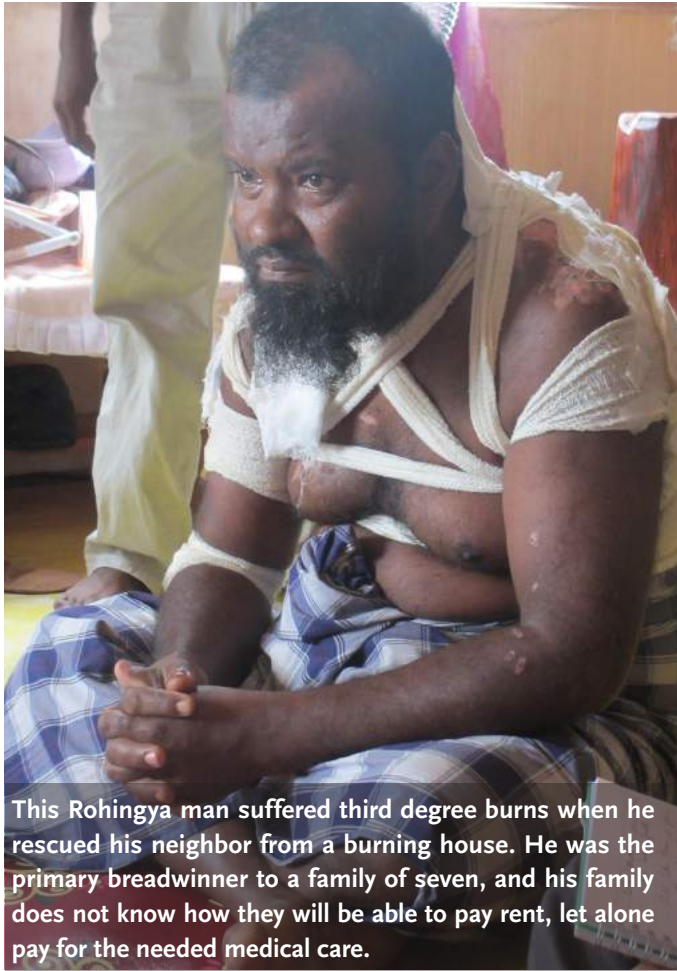
This Rohingya man suffered third degree burns when he rescued his neighbor from a burning house. He was the primary breadwinner to a family of seven, and his family does not know how they will be able to pay rent, let alone pay for the needed medical care.