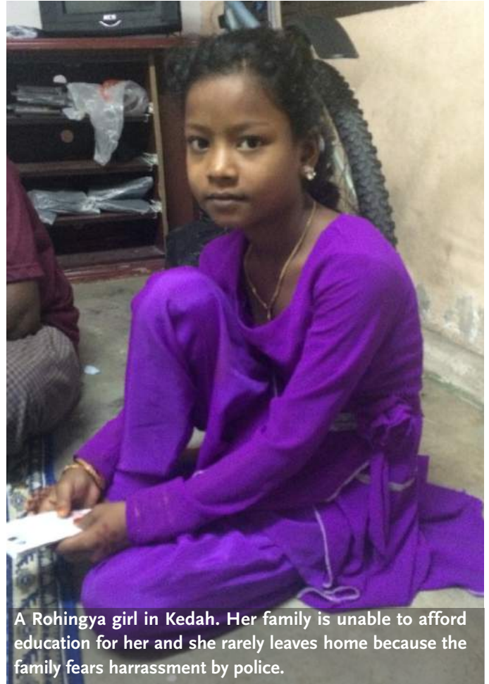
A Rohingya girl in Kedah. Her family is unable to afford education for her and she rarely leaves home because the family fears harrassment by police.

Malaysia’s economy is on an uphill trajectory despite recent fluctuations, with an expected unemployment rate of about