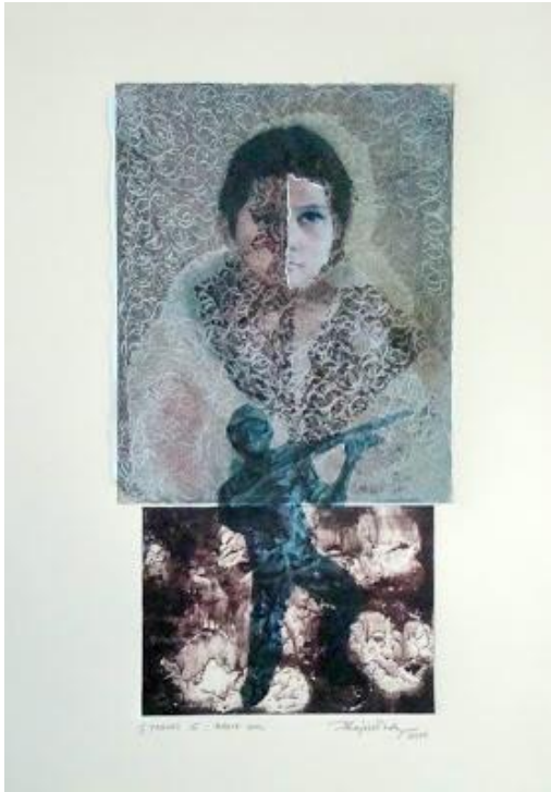
Imelda Cajipe-Endaya, Traces 15: Brave Girl , 2010, Monoprint (Figure 7D)