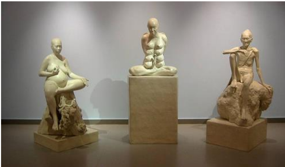
Agnes Arellano, Three Buddha Mothers: Vesta, Dea, Lola , 1995, Marble (Figure 6D)