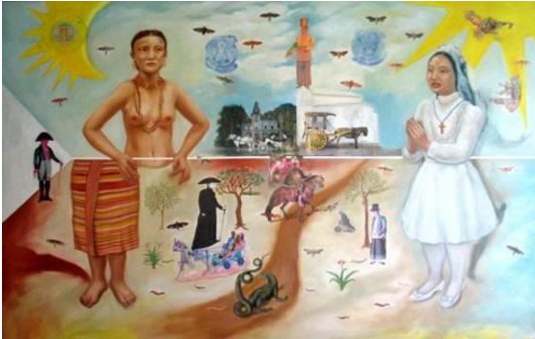
Karen Ocampo Flores, A Line of History , 2006, Acrylic on canvas (Figure 5D)