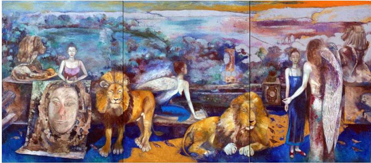
Kitty Taniguchi, Winged Lover , Oil on Canvas, 2010 (Figure 3D)