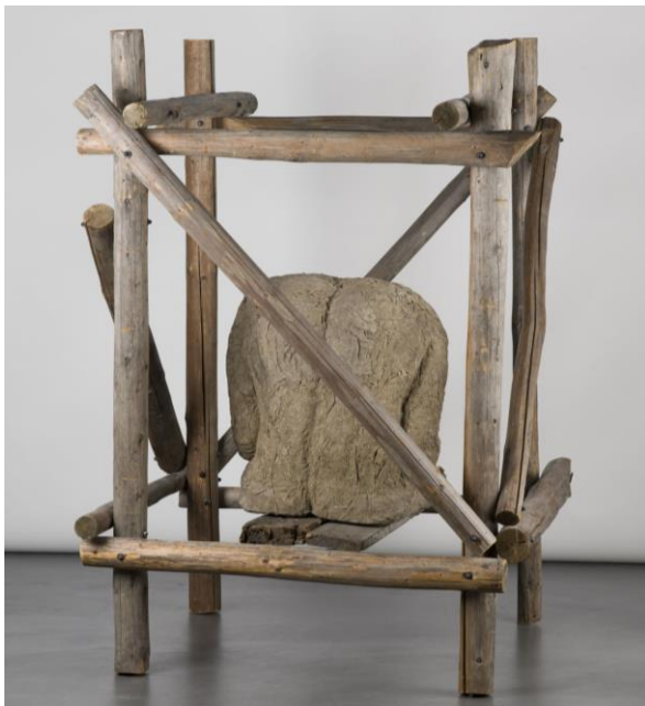
Magdalena Abakanowicz, Cage , 1981, Burlap, glue, and wood, MCA, Chicago (Figure 8D)