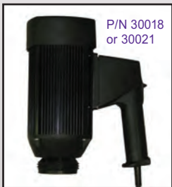
P/N 30018 or 30021

Two sampling ports available for oil sampling before and after filter (not shown in photo)