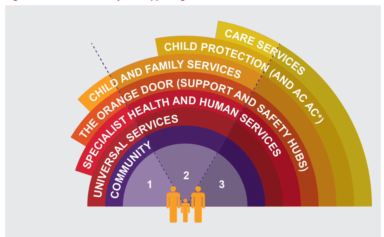
Figure 2: The Three Pathways to Supporting Vulnerable Children and Families