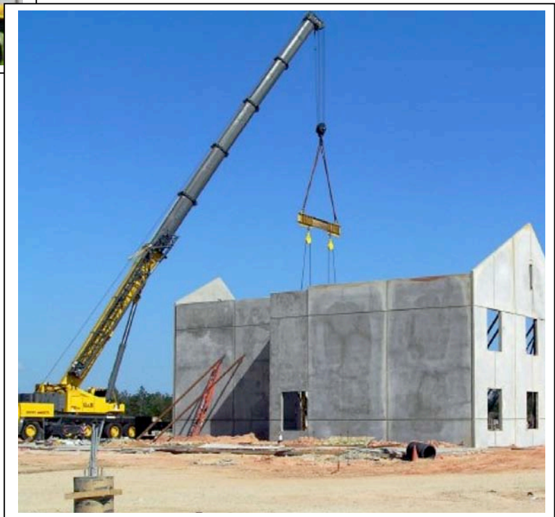
Progress as of September 24, 2007

Sandra Fralin SBTS, 2825 Lexington Rd., Box 1812 Louisville, KY 40280 SFralin@sbts.edu / 502-897-4623