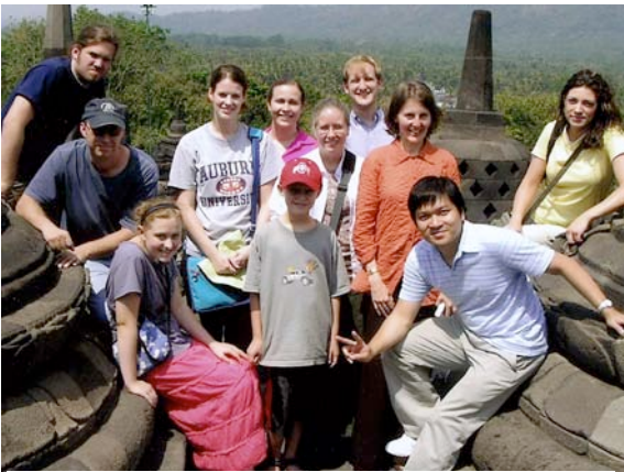
The team, atop the temple of Borobudur at Yogyakarta in central Java