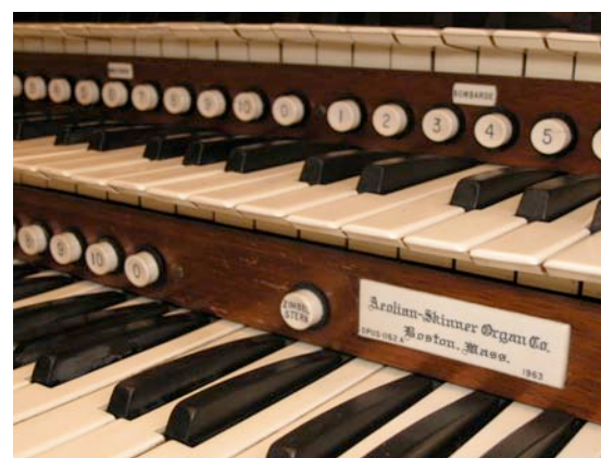
Aeolian-Skinner Opus 1162-A