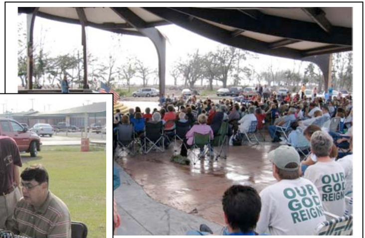
Worship under the roof, above