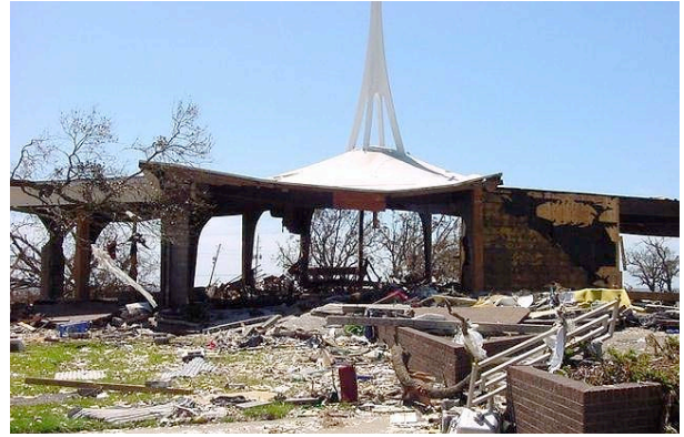
The sanctuary, before and after the storm.

One early estimate of the damage to the facilities was $12 million. The church that had been considering the construction of an additional education building was facing an unknown future—one that would include many financial and logistical challenges. The community was also affected, at the time of its greatest need, by loss of the church’s services—for example, the food pantry that had fed more than 450 low-income families each month was no longer available.