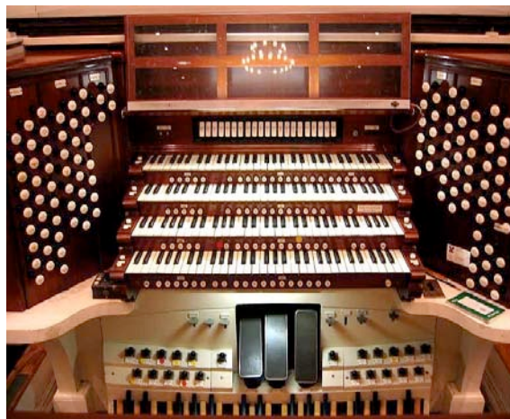
Photograph by Aeolian-Skinner, 1963

The project will cost about $750,000, and will assure the Seminary of many more years of great organ literature and accompaniment of congregational singing, played on an eminently worthy instrument.