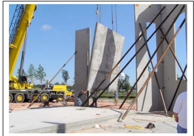
And the walls go up.

First Baptist Church of Long Beach, Mississippi was founded in 1909, and had a membership before Katrina of nearly 1,000.