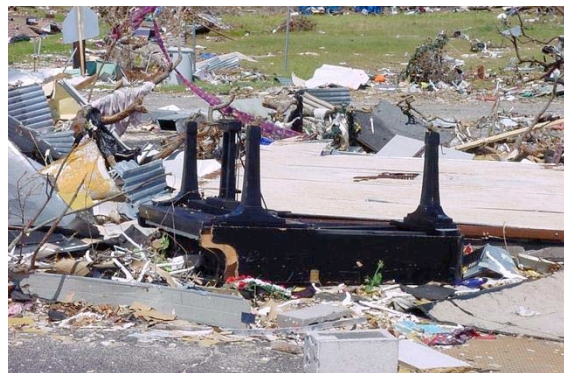
A grand piano lies upended in the rubble.