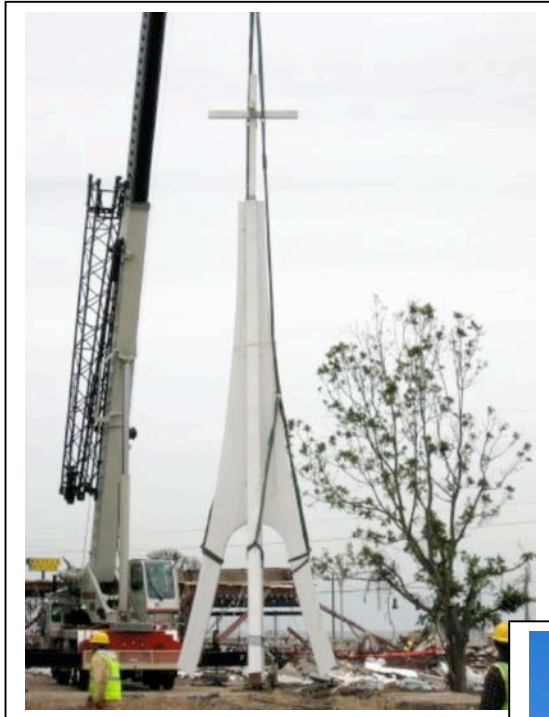
The spire and cross come down.

In June 2006 the congregation voted to move to a new site, and on October 30 the church announced the purchase of 17 acres at 300 North Cleveland Avenue, Long Beach. Ground was broken on March 4, 2007, and work began on the foundation early in May. And the song goes on.