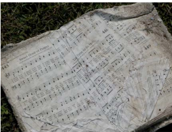
A rain-soaked hymnal lies open to "Sweet hour of prayer."

Like other churches, First Baptist Long Beach was completely destroyed. What had been a complex of beautiful modern buildings was reduced to rubble. The result has been preserved in many dramatic photographs. Two of those in particular poignantly illustrate the effect upon the music ministry.