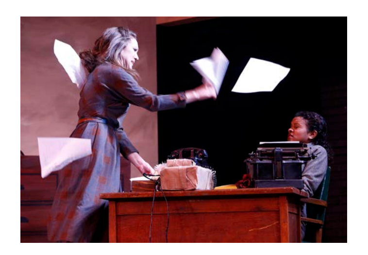
UA Opera Theatre – THE CONSUL, March 2014