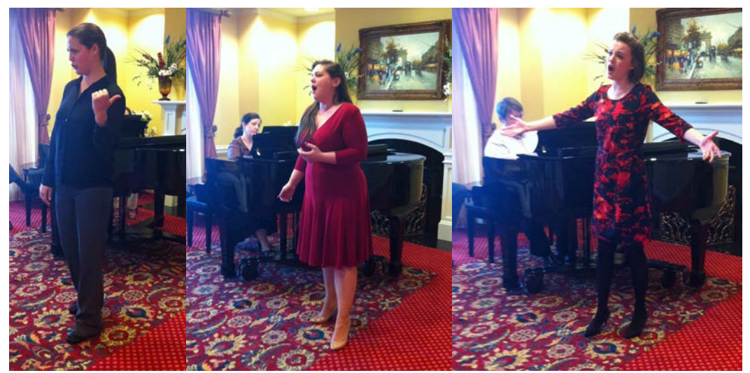
2014 Druid City Opera Workshop