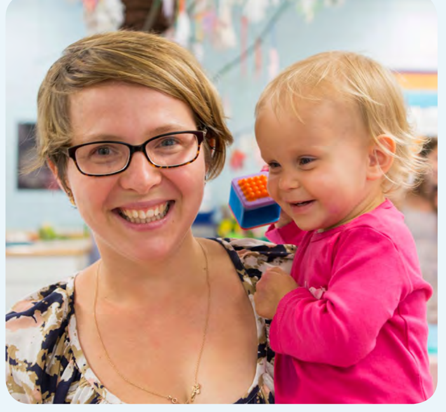
Serving Children, Strengthening Families, Building Community since 1906