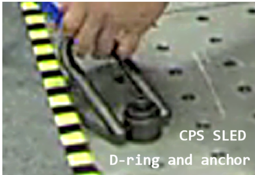
Figure 4: D-ring and anchor on CPS test sled

However, in a crash, tension on the Subaru tie down hooks will approach 1,700 lb, far exceeding their MBL. A severe failure of the hooks is near certain, thus freeing the crate.