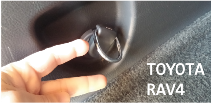
Figure 5: Consumer d-rings and anchors (Miskulin, Subaru press kit)