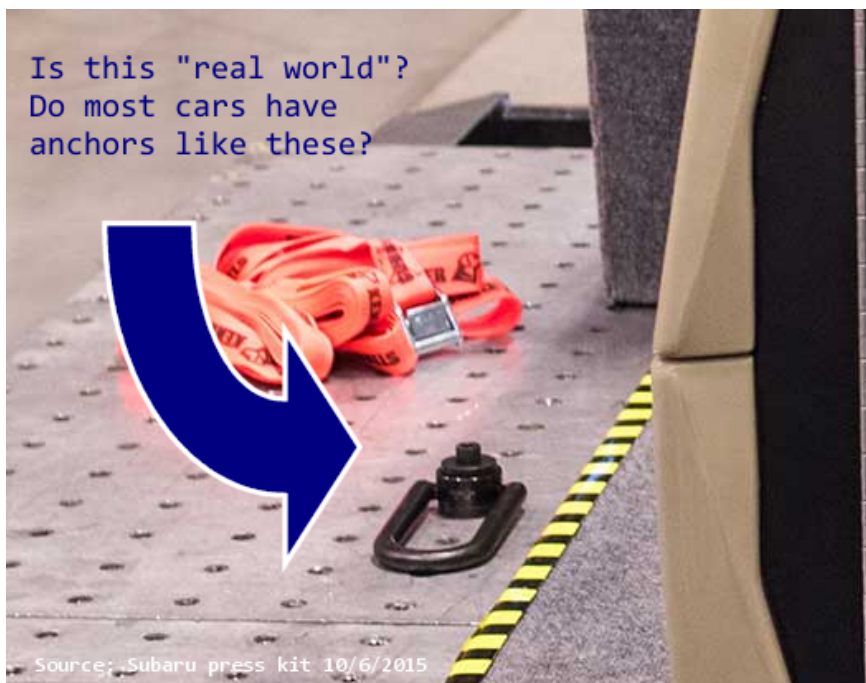
Figure 3: Anchor on CPS test sled

With the CPS study as a guide, CPS envisions the crate to be tied down with stays at 45 degree angles in both the vertical and horizontal direction on all sides, if possible. For our Subaru, that translates to 110 lb of tension in the front and rear directions with 220 lb directed downward. This is more than sufficient to prevent sliding and is in excess of the recommended 80% of load (our dog and crate) expected in normal hard breaking (ref: fmcsa.dot.gov).