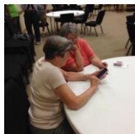
Refreshments courtesy of La Fiesta Mexican Restaurant

The Senior Card Social was a success! Eighteen men and women enjoyed food, fun, and fellowship. Come to the Garden and join us on September 9, Wednesday at 1:00.