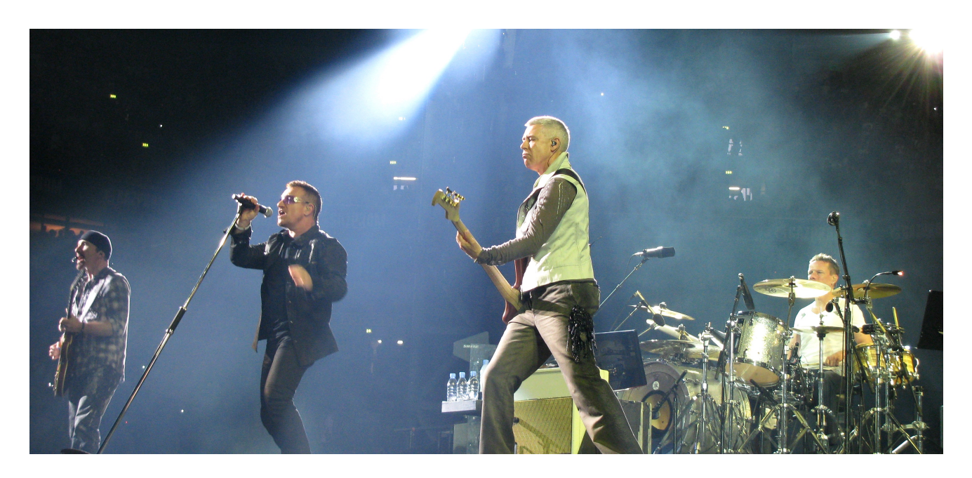
"One" - U2

In U2's song, "One," the band sings about love and forgiveness. It includes the following lines: