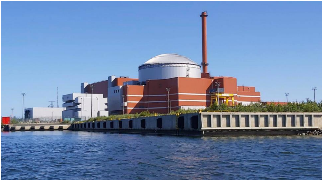
Olkiluoto 3 power station is now completed