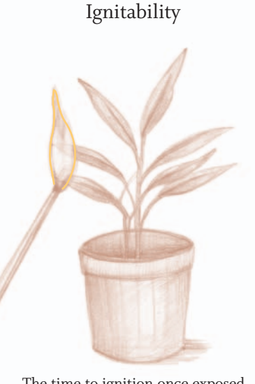
The time to ignition once exposed to an ignition source such as an ember or flame.