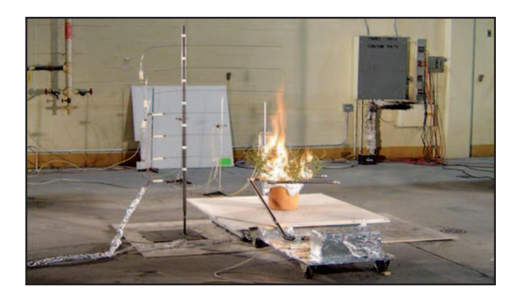
FIGURE 1: Controlled burn tests of shrubs were conducted at the National Institute of Standards and Technology.

species. Utilize plant identification keys, landscaping books (see list of examples below), nursery personnel, and/or expert identification to help with proper identification.