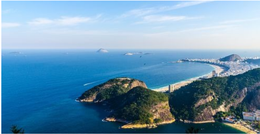
Harbor of Rio de Janeiro

On January 1, 1502, an explorer from Portugal named Goncalo Coelho and his crew sailed into a huge bay by what is now Brazil. A bay is a body of water that is partly surrounded by land. The explorers thought they had found the mouth of a large river. So they named the place "Rio de Janeiro," or "River of January." The bay they found is known today as the Harbor of Rio de Janeiro.