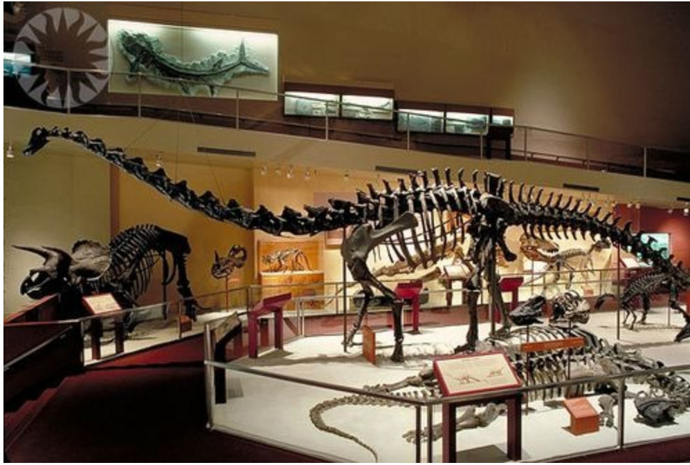
Skeleton of a sauropod

Sauropods didn't always start out big. When a sauropod hatched from an egg, it usually weighed less than 11 pounds. But sauropods grew extremely quickly over the course of about thirty years. By the time they were done growing, they would have been at least 10,000 times heavier than when they were born! This quick rate of growth probably helped sauropods stay alive. The larger a baby sauropod was, the more likely it was to be able to stay safe from predators. This may have contributed to the overall large size of the sauropod group.