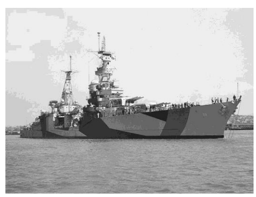
USS Portland (CA-33)

Just as Portland completed her first loop, Hiei turned up and the two ships traded salvos. Portland claimed hits. Hiei steamed by, and Portland found herself surrounded by American ships, without a target, circling helplessly.