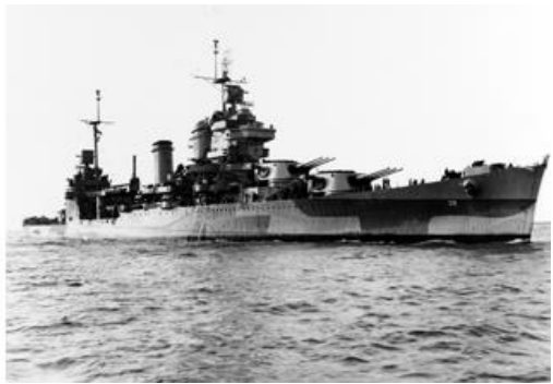
USS Atlanta (CL-51) and USS San Francisco (CA-38)

Behind Juneau sailed four more destroyers, the brand-new Fletcher bringing up the rear. Callaghan's formation was poor. His ships with the newest and best radar systems were in the formation's center or rear.