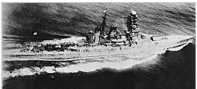
Japanese Battleships Kirishima (left) and Hiei (right)

Key to the plan were special 14-inch shells loaded in the magazines of Hiei and Kirishima—Type 3 shells, originally designed for anti-aircraft work. Each shell's casing had a bursting charge that would scatter 470 individual incendiary submunitions across an area. These could shatter the parked planes on Henderson Field, but were useless against steel warships. One heavy cruiser and 10 destroyers, including Hara's Amatsukaze, would take part.