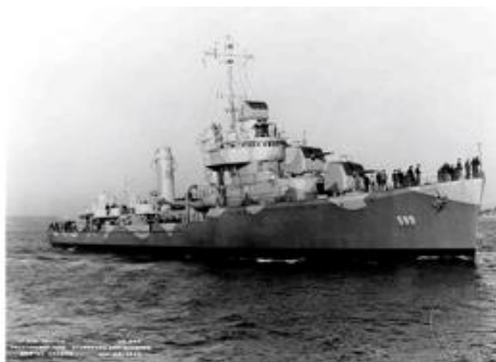
USS Aaron Ward (DD-483) and USS Barton (DD-599)

On Barton all was chaos, but only for a few seconds. Sixty percent of her crew died as she quickly sank; the torpedo had hit her main fireroom, and then another enemy torpedo had struck her forward engine room.