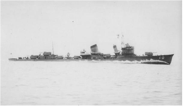
Japanese Destroyer Akatsuki