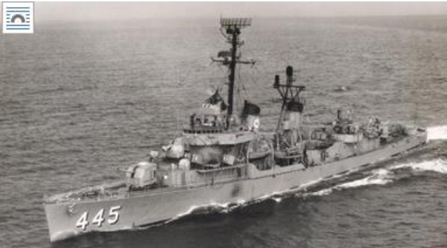
USS Monssen (DD-798) and USS Fletcher (DD-445)