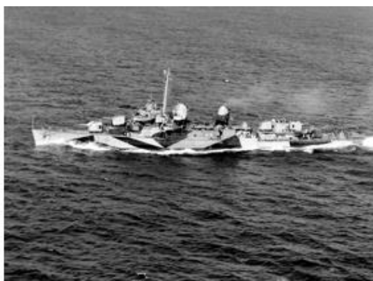
USS Helena (CL-50) and USS Cushing (DD-797)

Callaghan turned his ships due north. His radar picture was not clear. He called Helena on voice radio to find out what was going on, but the frequency was jammed by ill-disciplined chatter from other ships.