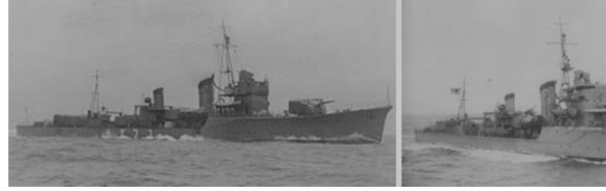
Japanese Destroyers Yudachi (left) and Harusame (right)

The Japanese were having their own difficulties. Hiei and Kirishima were ready to open fire on Guadalcanal when Yudachi signaled Abe: 'Enemy sighted.'