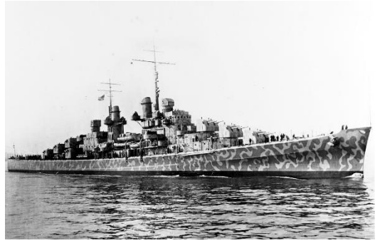
USS Juneau (CL-32)

Juneau followed. She was hit early by a torpedo that struck her port side in the forward fireroom. The central fire control was knocked out. Unable to move, she fired a few rounds, some of them seemingly at Helena, then staggered out of battle.