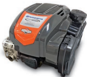
725exi MID TO HEAVY-DUTY APPLICATIONS