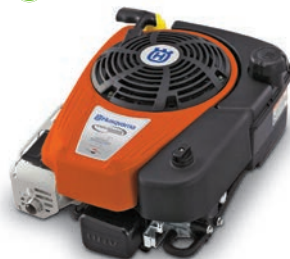
775ex HEAVY-DUTY APPLICATIONS