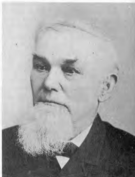
George E. Crouse 1825 – 1907