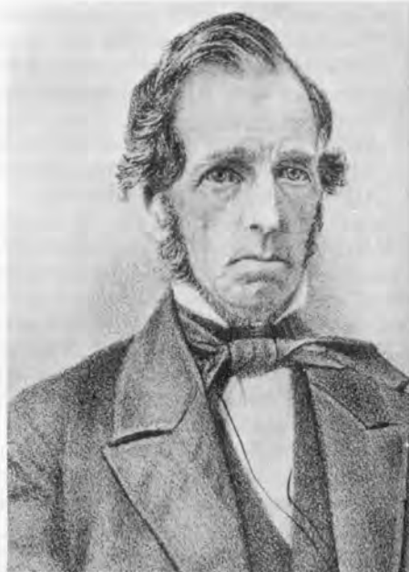
Ethan Alling 1800 – 1868