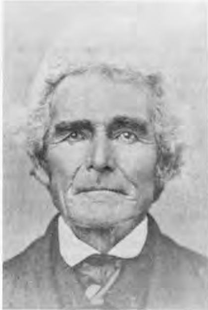
Luman Lane 1796 – 1879