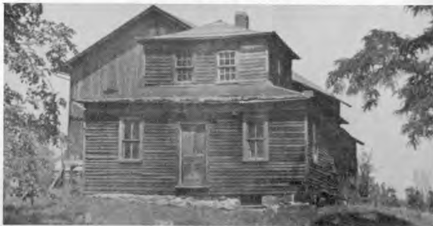
Oldest House in Twinsburg

responded to his name with a verse from the Bible. It was sort of a combined Thanksgiving and Reunion, with a big dinner in the middle of the day.