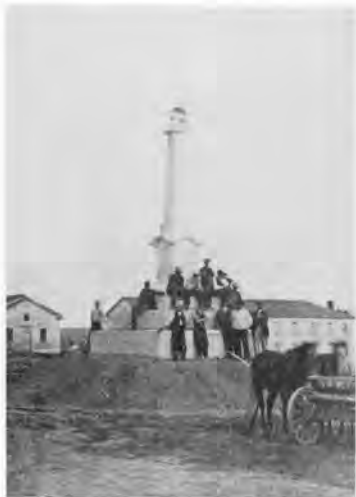
Soldier's Monument Old Congregational Church Old Academy Building