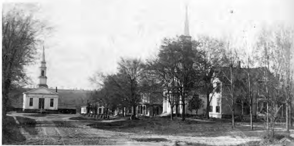
Church Street Early 1900's