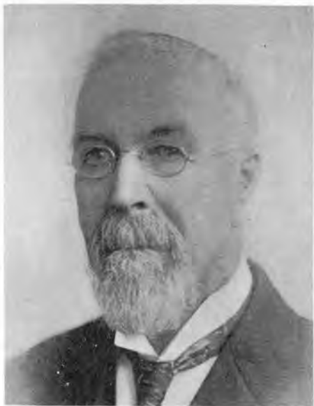
Chauncey B. Lane 1844 – 1927