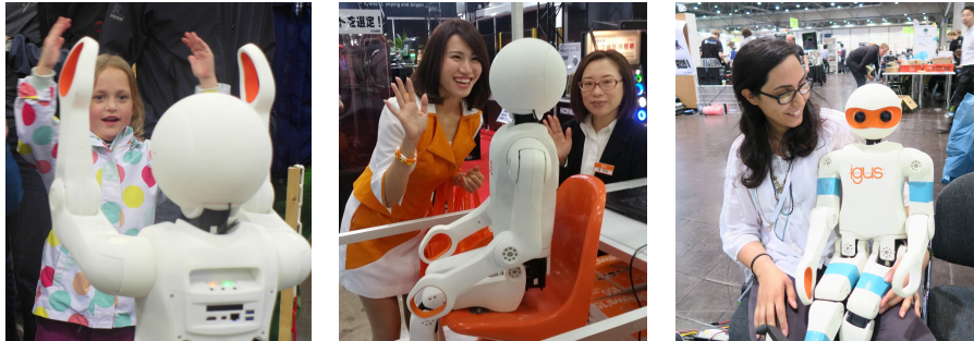
Fig. 4. Example human interactions with the igus® Humanoid Open Platform, including waving to children (left), and face tracking (middle).

this includes demonstrations at Hannover Messe in Germany, and at the International Robot Exhibition in Tokyo, where the robots had the opportunity to show their interactive side (see Fig. 4). Demonstrations ranged from expressive and engaging looking, waving and idling motions, to visitor face tracking and hand shaking. The robots have been observed to spark interest and produce emotional responses in the audience.