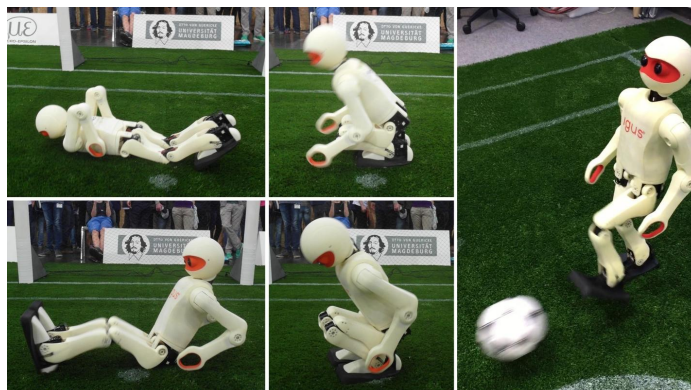
Fig. 3. Dynamic get-up motions, from the prone (top row) and supine (bottom row) lying positions, and a still image of the dynamic kick motion.

however, is a representation that was specifically developed for humanoid robots in the context of walking and balancing.