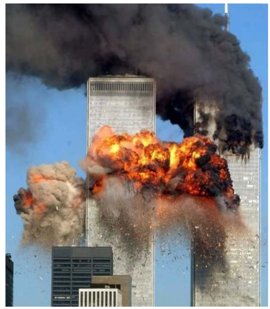
9/11 IS QURANIC VERSE 9:111 AND SHARIA LAW

Quran 3:151 "Soon shall We cast terror into the Hearts of the Unbelievers"