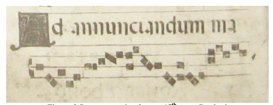
Figure 3 Square notation from a 15<sup>th</sup> cent. Gradual

In the 12<sup>th</sup> century, neumes began to develop "heads" somewhat like our modern musical notation. The "heads" of the neumes were square or rhomboid (generally diamond-like), rather than rounded. Square notation developed from the Central French notation, and spread throughout Europe. By the thirteenth century, it was the most common form of neumatic notation (Floros, p. 88).