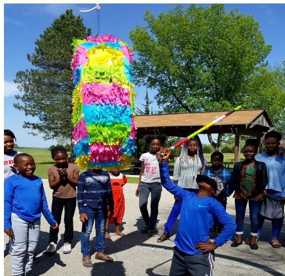
WRCC kids enjoying the Easter Celebration held at Whispering Winds Camp.

We will have training in May for all those who volunteer to assist with Wednesday, Sundays, and camp activities. This training is required for all volunteers. We will focus on communication and how we can improve to work better as a church family. The training is May 15th & 22nd from 5:30-8 p.m.