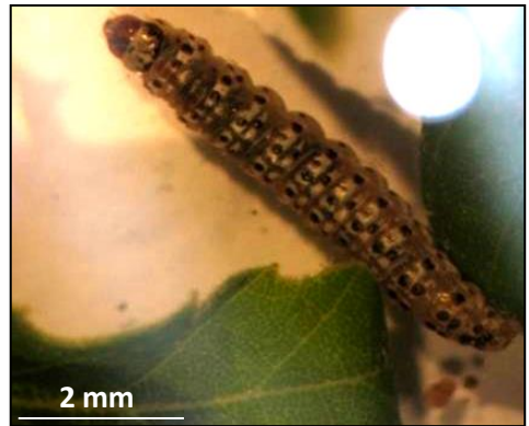
Fig. 3. Larva of Pammene giganteana