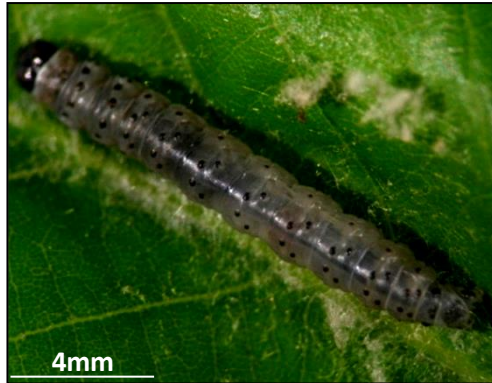
Fig. 1. Larva of Archips xylosteana