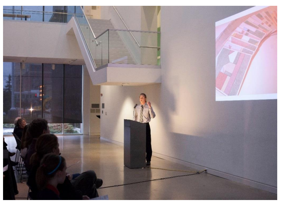
Photo: Contemporary Connections: PechaKucha at Rochester Art Center

After reviewing each individual's skill set and assigning roles, the group should determine a job description, goals, and deadlines for each role.