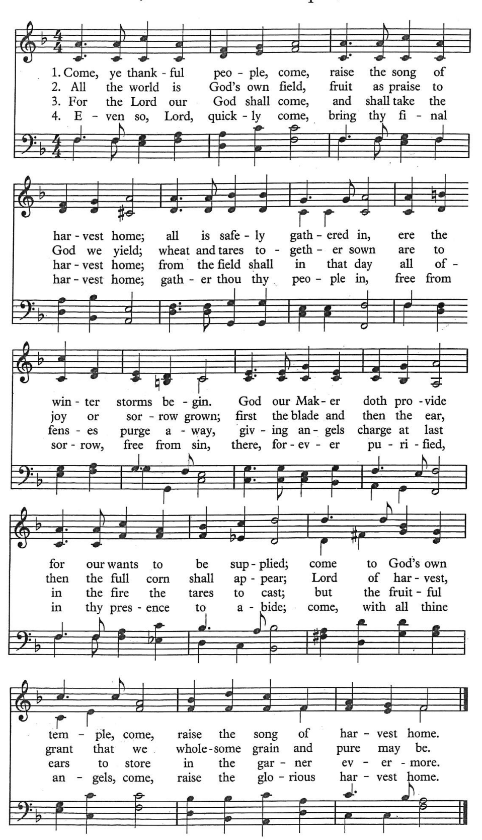
694 Come, Ye Thankful People, Come