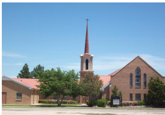
First United Methodist Church – McCamey