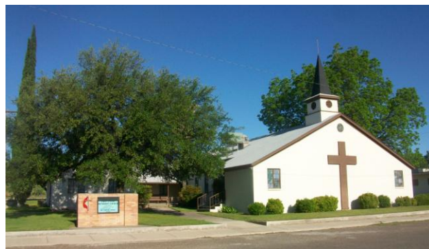
First United Methodist Church – Iraan